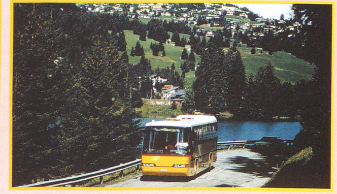
LEFT: St Moritz - ABOVE LEFT: Leaving Chur - ABOVE RIGHT: Lenzerheide - BELOW LEFT: Sur - BELOW RIGHT: Julier Pass The Post Bus Routes offer a different view of Switzerland. Try some of the Route Express Lines, the Julier from Chur to St Moritz is one of these