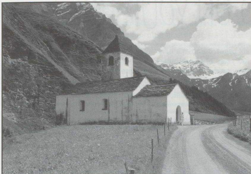
Entry to Thalkirch village. 9.7.97