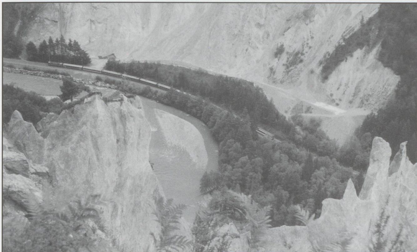
Rhine Gorge, Chur bound train approaching Versam from Conn to Valendas footpath. 3.7.97