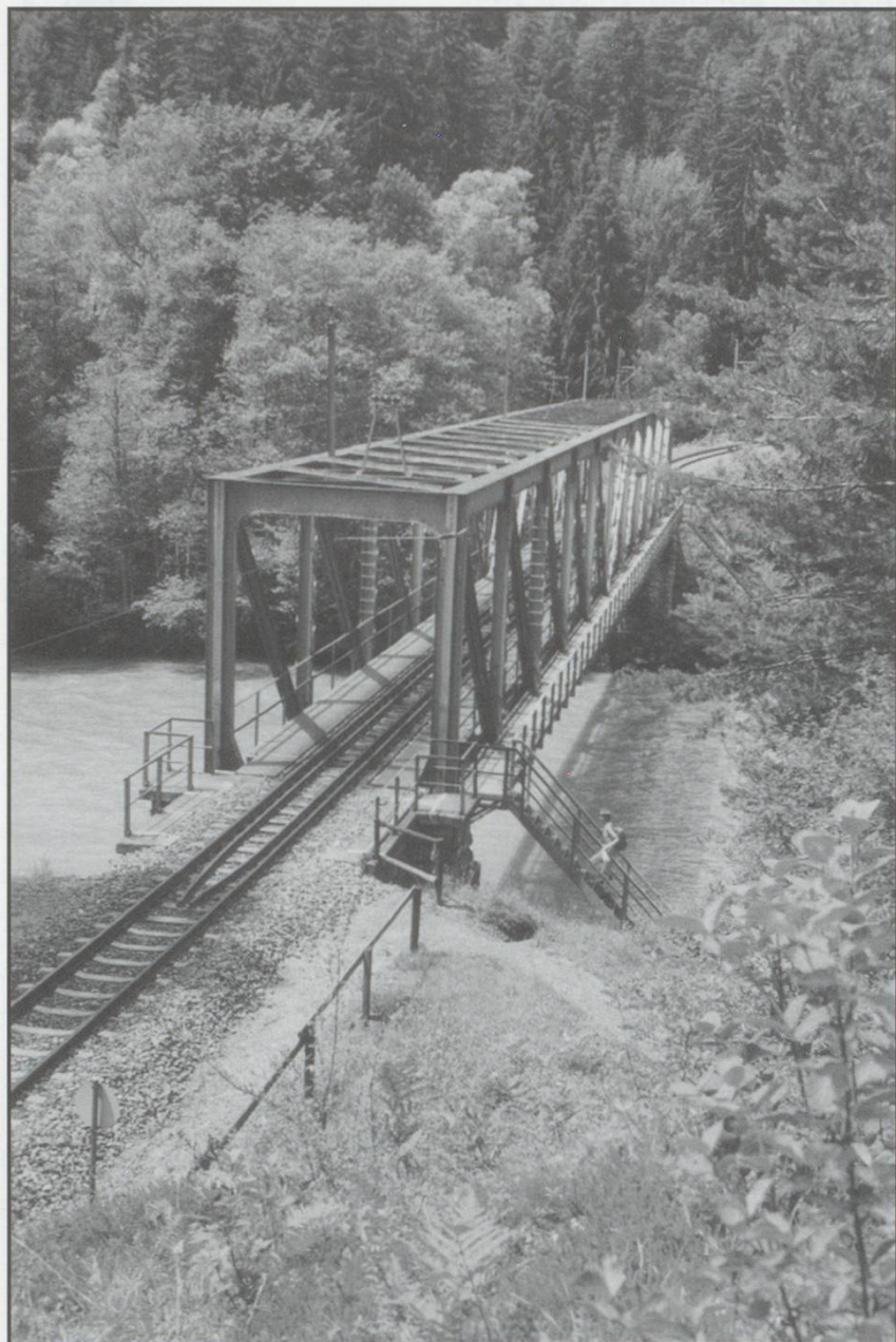
Bridge over (Kwai) Rhine below Conn, near Versam. 1.7.97.

gets different views of RhB and Rhine by heading towards Sagogn, where the possibilities are either a return by bus direct, or by the foot-bridge over the Rhine catching the train from Valendas Station.