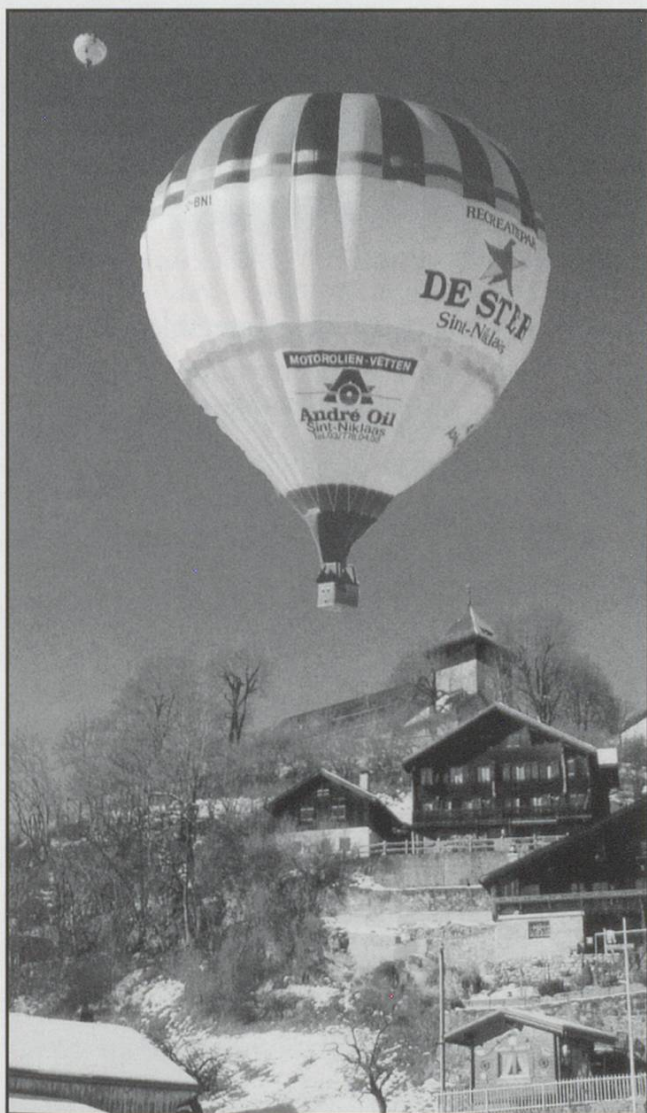
A balloon above Château-d'Oex.

The 26th Festival will be from 24th January to 1st February 2004. Take a rail trip to Chateaux d'Oex and you could join in the spectacle and fun and possibly take a different form of transport in Switzerland.