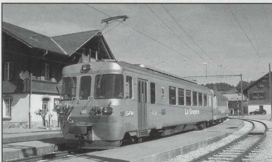
UPPER: Steam Engine Bercher at Blonay 7th September 2002.