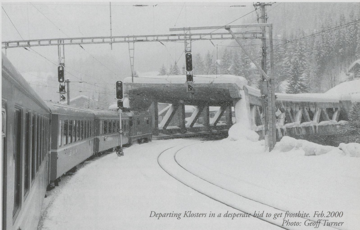
Departing Klosters in a desperate bid to get frostbite. Feb.2000

travelled on certain trains to and from Landquart and had a room within Scuol station for promotional of the region. Within Scuol were posters and models of the Vereina tunnel and its environs which were a total delight and many admired both the models and concept.