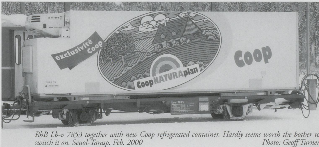
RhB Lb-v 7853 together with new Coop refrigerated container. Hardly seems worth the bother to switch it on. Scuol-Tarasp. Feb. 2000

If you have enjoyed the description of my experiences then please go to Klosters in the winter and enjoy. It may be the most exciting experience you ever have.