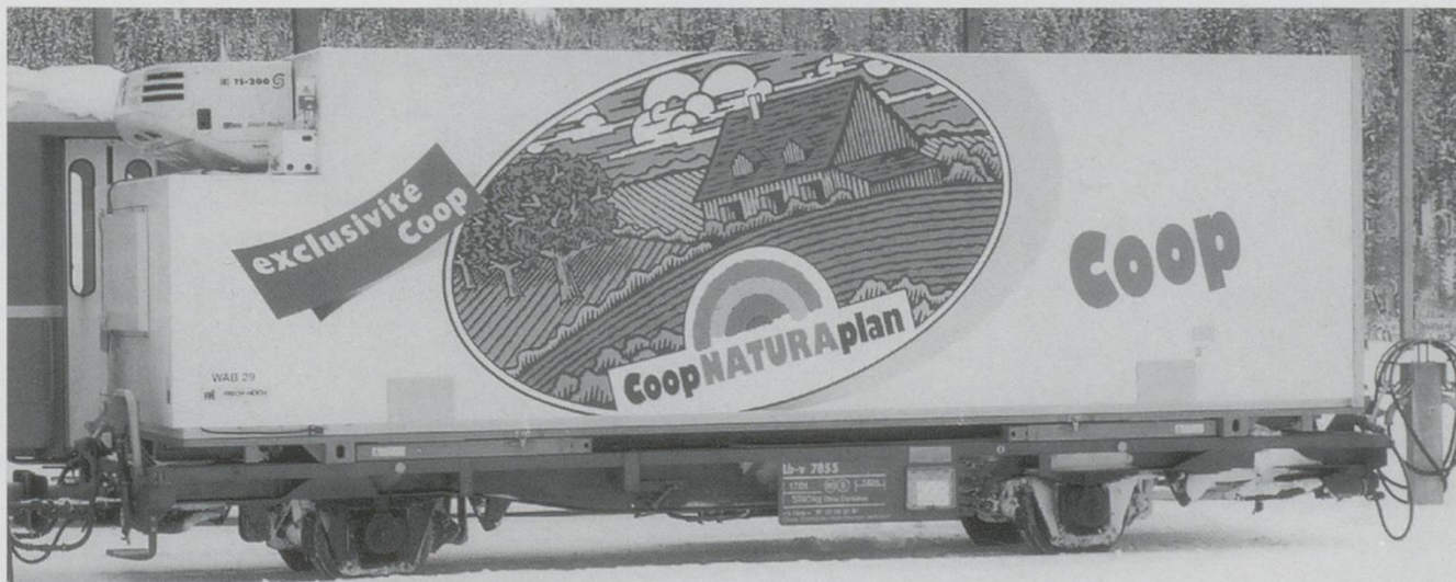
RhB Lb-v 7853 together with new Coop refrigerated container. Hardly seems worth the bother to switch it on. Scuol-Tarasp. Feb. 2000

If you have enjoyed the description of my experiences then please go to Klosters in the winter and enjoy. It may be the most exciting experience you ever have.