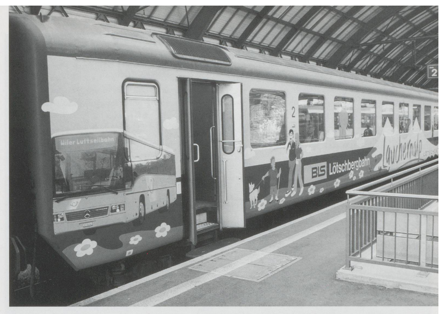
Pictured at St Gallen is a very colourful, or at least it looks colourful, BLS coach on a Zürich working and then probably to Interlaken. August 1999. No doubt someone will tell us the significance of the livery in time for the June issue, please!

The most interesting reopening was on the Simmental Line between Spiez and Zweisimmen. Although the fallen trees could be cleared relatively quickly, the BLS does not have enough resources to replace overhead masts on two lines at the same time. Initial efforts were therefore concentrated on the Frutigen - Kandersteg section of the main line, where a through service was restored on 31st December. This would leave a cleared line with no method of working it: main line diesel traction and DMUs are an unheard quantity in Switzerland. In the end, they found spare trains from the BOB - not their landlords at Interlaken Ost, but the German Bayerische Oberland Bahn! They were able to loan five fiveunit DMUs, built by Integral in Austria in 1999 but which require rectification work before they are put into normal service. These took up the Regionalzug diagrams on 31st December, working in pairs with one unit spare until 12th January when normal service could be resumed. During this period the RX expresses were cancelled and a BLS shunter used on goods trains.