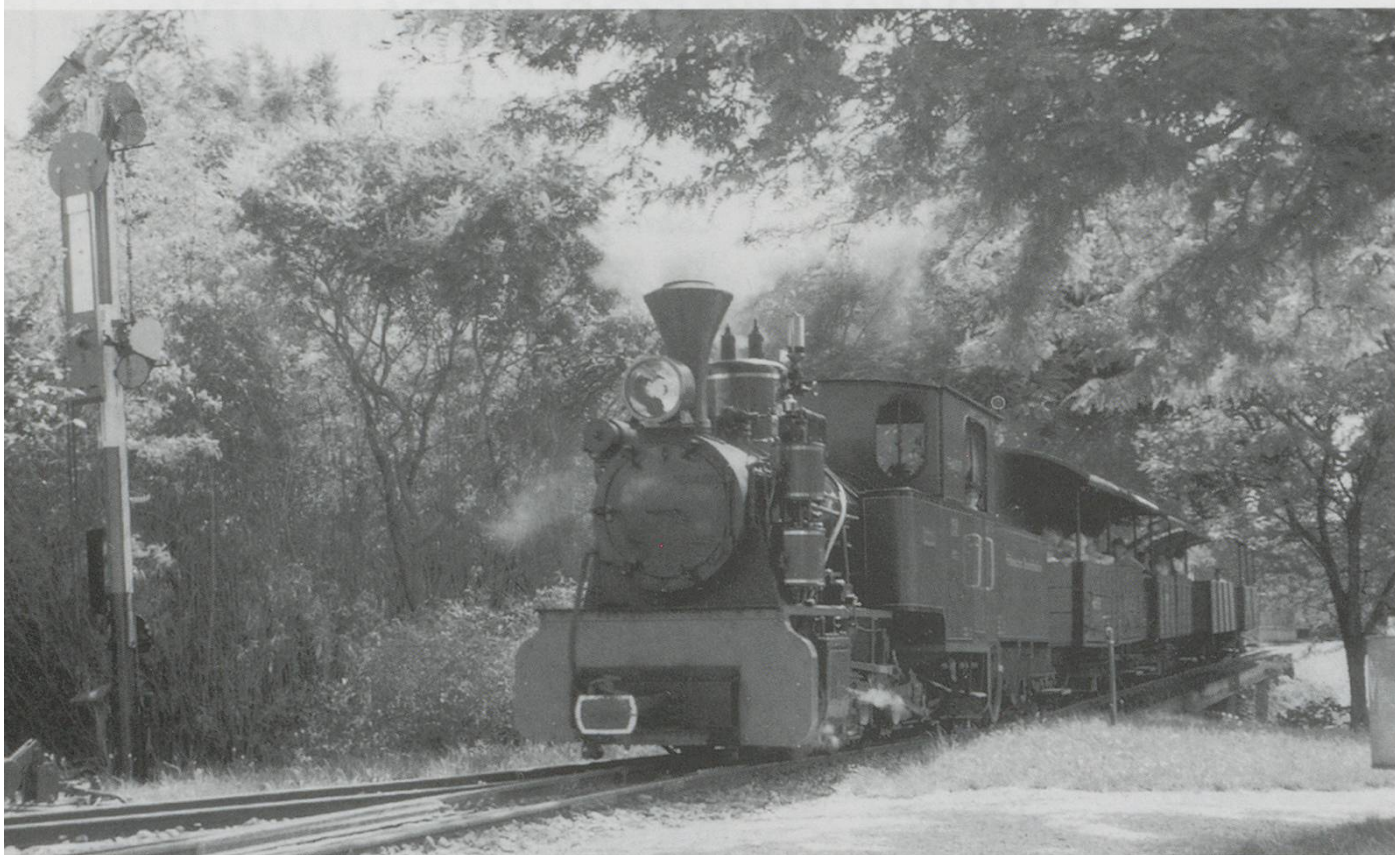
G3/3 "Sequoia" entering Baumschulsee Station. July 1998.