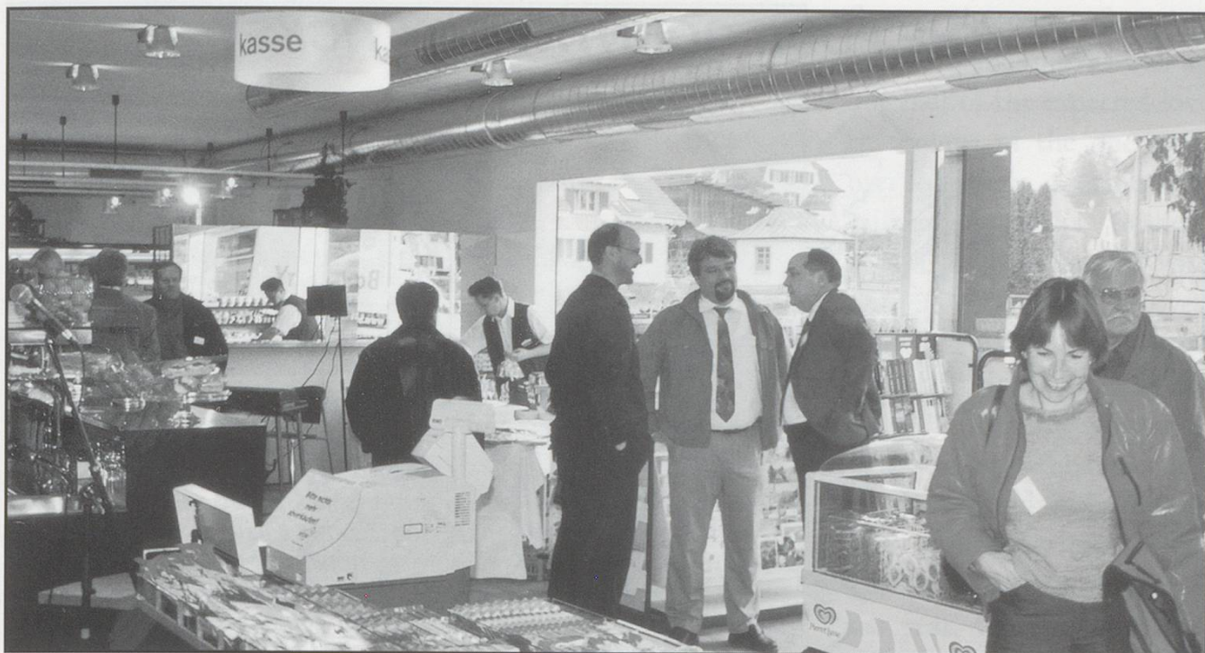
ABOVE: Inside, the large windows towards the road let in lots of light. As this station (the SBB one) is about a mile from the town, the avec store is not really in competition with other suppliers.