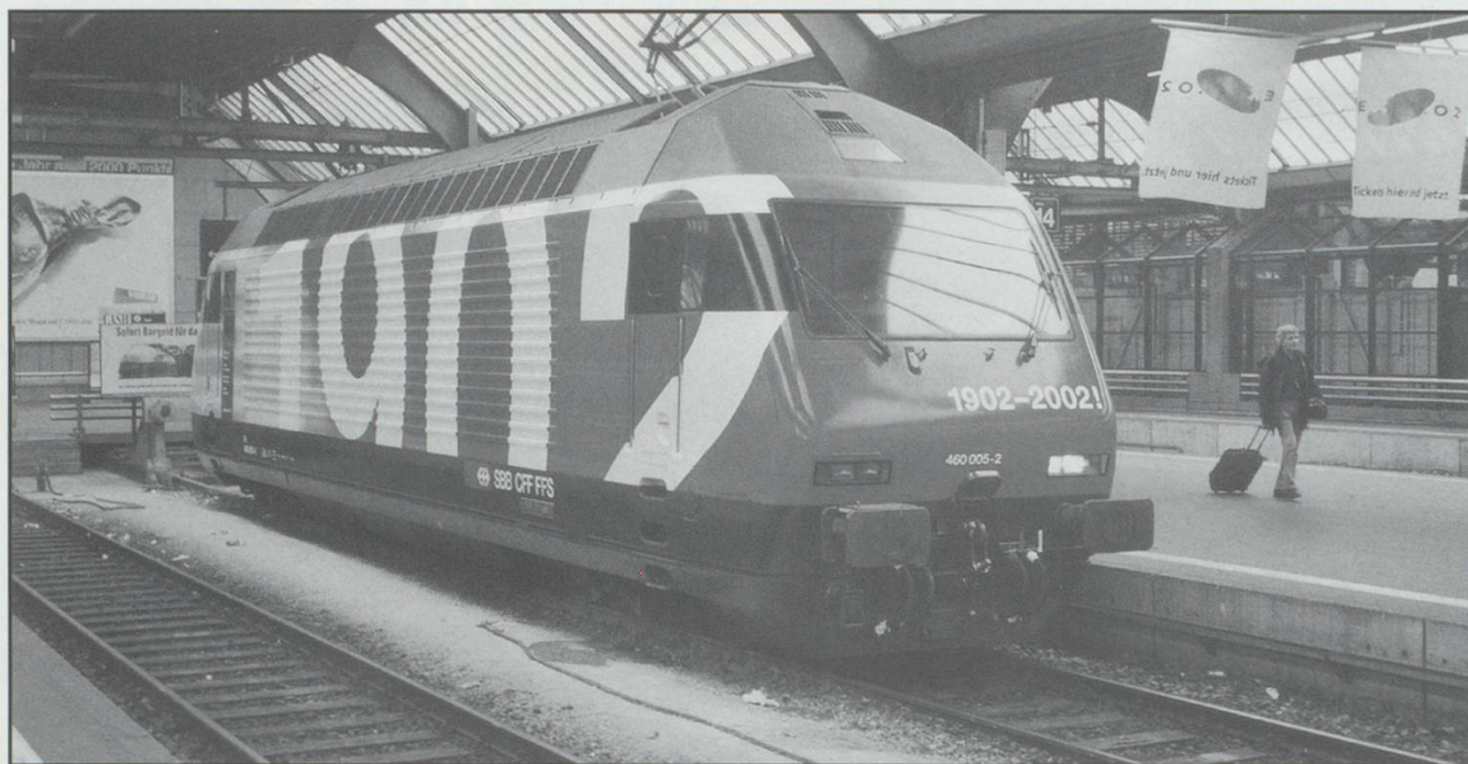
460 005-2 was presented to the press on the 17th of January; it carries the pertinent years on its sides: 1902, the start of operations as Swiss Federal Railways on one side, and...

The year 2002 is a special year for the Swiss Federal Railways: 100 years of operation. On the 20th of February 1898, the Swiss (at the time, that meant only the men) voted with a 68 % majority to nationalise the biggest of the then private railway companies. Operation under federal control started on the 1st of January 1902. Now, normally, this would have been cause for a big celebration... But first of all, only four years ago, all the stops were pulled out for the "150 years of Swiss Railways" celebrations. Secondly, 2002 is the year of the national "EXPO 02" exhibition, which will severely stretch all resources. It was thus decided to have only a few, but very special events: