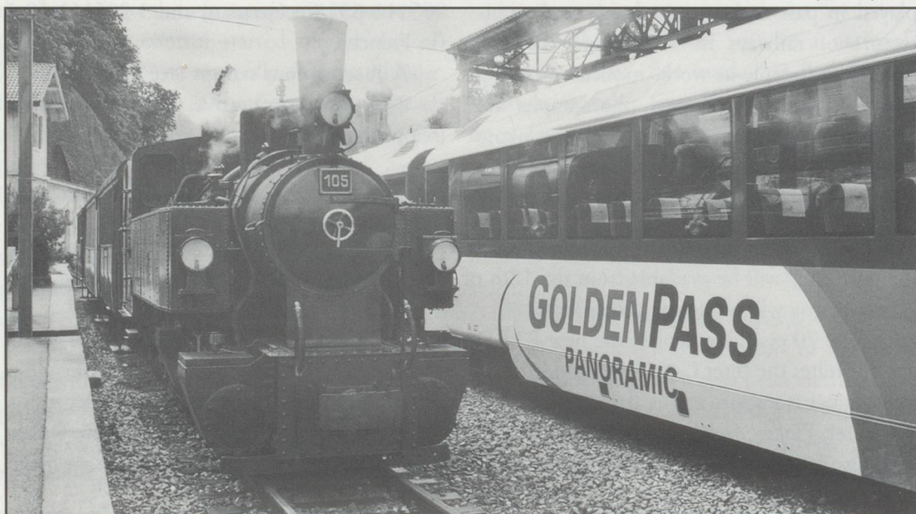
Photo 2 - Below And it was! Mallet No.105 of the Blonay-Chamby museum railway, was waiting with a private charter not for me, I am sorry to say!