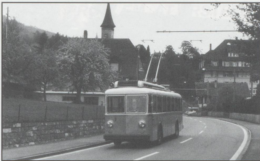
Trolleybus no. 3 "en route"

Berna supplied nine two-axle vehicles to run the service and these had bodies by Gangloff (odd numbered vehicles) and Ramseier and Jenzer (even numbers). The bodies were identical and no destination blind equipment was provided, destinations from Thun Station being shown on coloured boards placed in a nearside window above the front