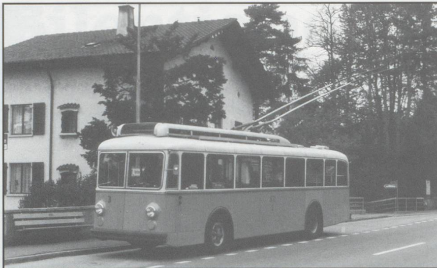
Trolleybus no. 3 "en route"

PTT Museum. Thus ended one of the most interesting trolleybus systems to be found anywhere in Europe.