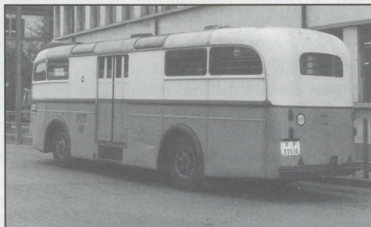
PTT postal trailer no. 72 at Thun

All nine trolleybus chassis were built for the STI in 1952 by Berna. They were all fitted with bodies made from steel and light alloys giving the trolleybuses a tare weight of 10.6 tonnes. The vehicles were powered by direct current with series-wound motors producing 118 kilowatts of power. Electrical equipment on the trolleybuses was supplied by Sécheron. Each vehicle had seating capacity for 40 passengers with a further 33 places for standing.