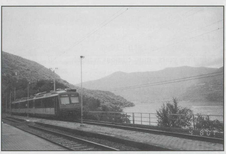
Pino-Tronzano, the first station on Italian soil on the Bellinzona-Luino line.

Ticino is an area of Switzerland that is not as widely visited by the British, as are places in the Bernese Oberland, Graubünden or the Swiss Riviera. However, there are some interesting railway journeys to take, with some beautiful scenery to be seen.