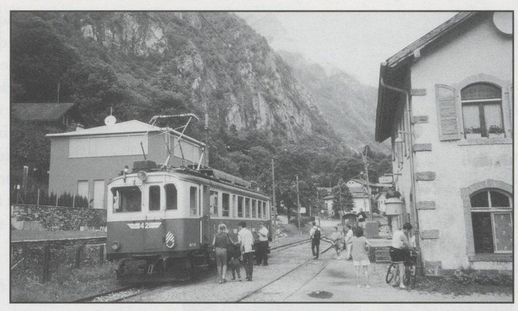
Cama - terminus of Misox line from Castione

tive pulls period coaches along the main line to Lugano - imagine that happening on a very busy main line in the UK. For those of you interested in rolling stock, during our trip we saw various vintage steam and electric locomotives, together with carriages from the Rorschach-Heiden Bahn, Ferrovia Nord Milano, and others.