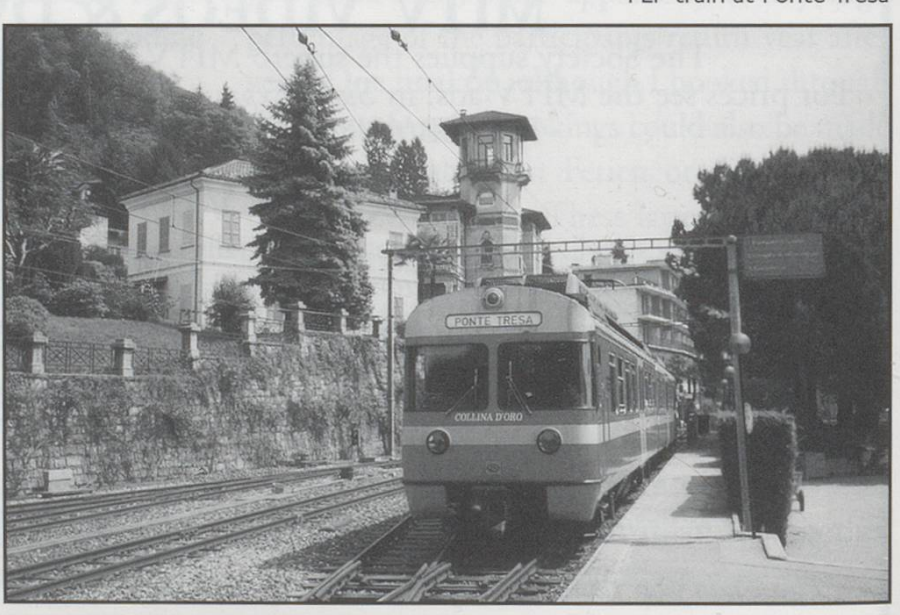
FLP train at Ponte Tresa

The train service is very frequent and busy, but twice a day in summer the SNL boat makes the journey from the Swiss side of Ponte Tresa back to Lugano, so a round trip is possible.