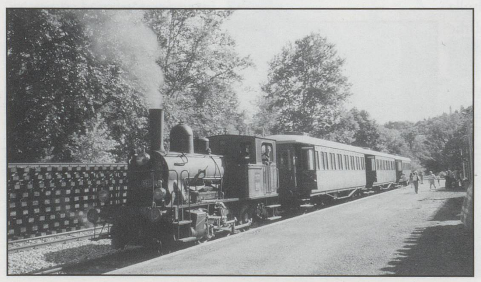
EDITOR'S NOTE – A detailed article on the Misox/Mesocco line by Michael Farr will appear in the next edition.

well, there are still the closed Lugano tramways to Tesserete and Dino/Cadro to seek out, the Customs Museum, only accessible by boat from Gandria, which sounds interesting, and the Monte Generoso rack line from Capolago. Roll on 2003!