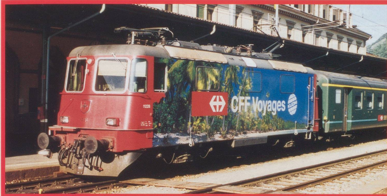
One of the very few Re 4/4s to carry advertising livery, No. 11228, is seen here in Brig in June 2002. It carries "CFF Voyages" and "Kuoni" Logos, drawing attention to the partnership of the SBB with Kuoni-Travel. At the time, the other travel companies did not universally appreciate this partnership with the still state owned SBB.