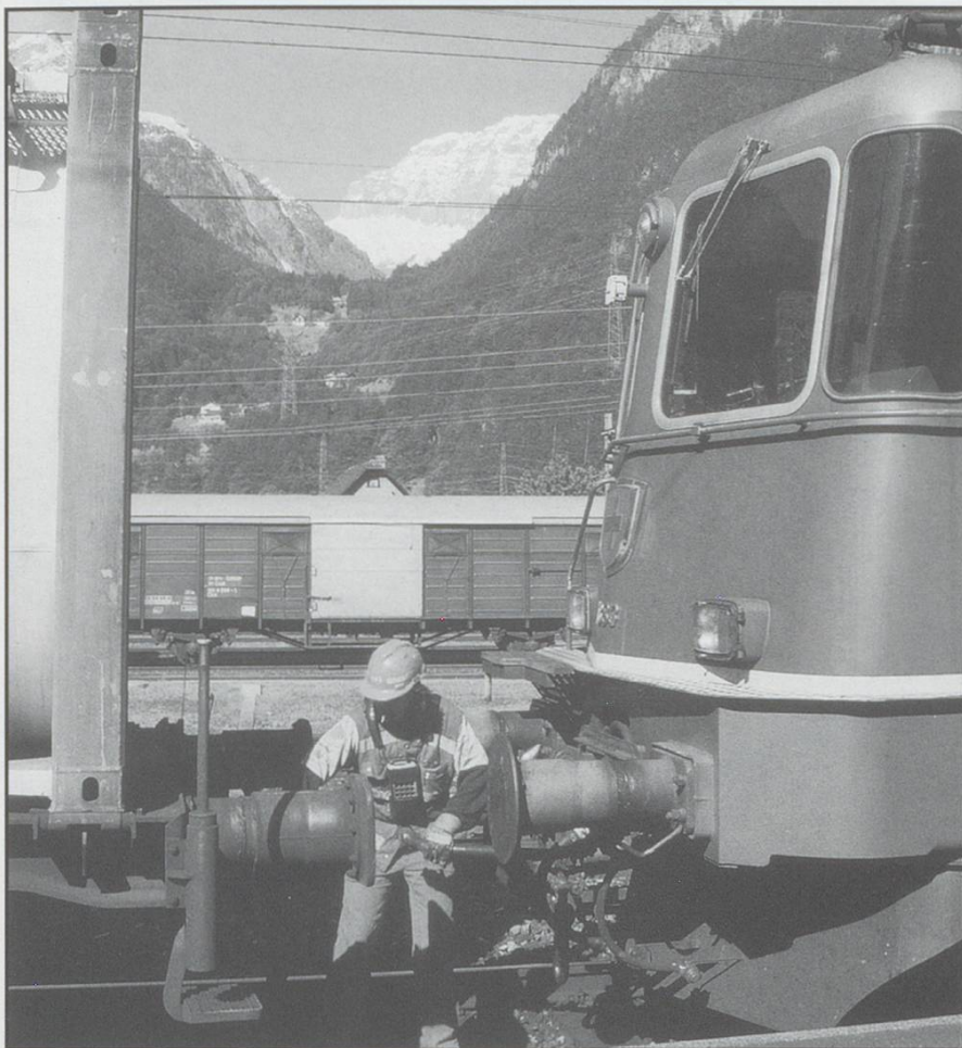
Erstfeld 30/05/02 - Banking loco, Re4/4 II 11383, is about to be coupled to the rear of the S/B intermodal train when the problem is spotted.

Thursday 30th May was the fifth and last full day of my 2002 visit to Switzerland and I awoke to clear blue skies and a few fluffy white clouds hugging the higher peaks, "MITV" weather! Although the longest day was only just over three weeks away, the high mountain backdrop at Erstfeld (from which a party of eight or so Alpine Choughs descended at about 07.30 each morning and glided over the loco depot towards the river) kept part of the station in shadow until 09.00. However, from that time the sun was suitably positioned to take photographs from the north end of Erstfeld's main southbound platform and I spent a very rewarding hour doing just that. To add to the photographic opportunities an operational problem occurred resulting in some southbound trains being routed "wrong line"