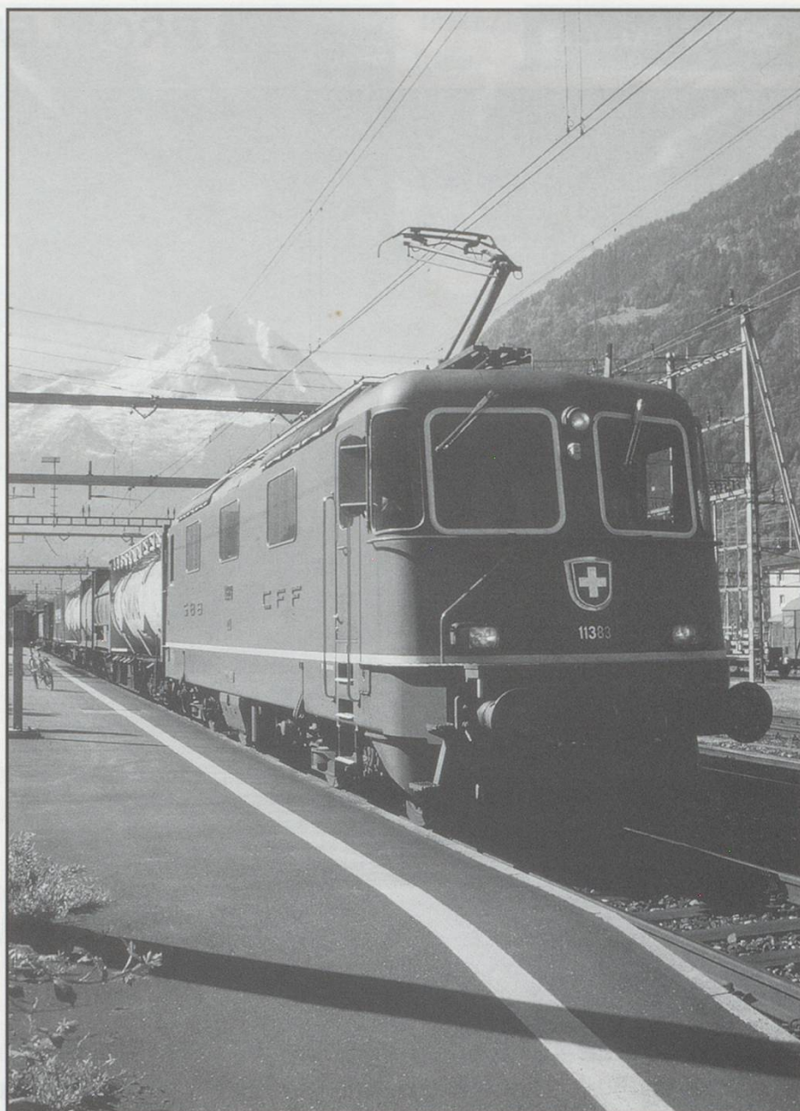
Erstfeld 30/05/02 - Re4/4 II 11383 waits to draw forward with the rear four vehicles of the S/B intermodal to start the re-marshalling move.

The outstanding weather conditions prevailed until sunset and indeed throughout the next day. I spent the late morning at Arth-Goldau where among a feast of trains I managed three shots of SOB (ex - BT) "456's" – well one has to keep the "Ed." happy! In the afternoon I returned to Sisikon and, requiring the very best of weather for photography purposes, finally achieved a goal that had eluded me on my last three Swiss visits, a walk to Flüelen along the Axenstrasse which I will describe in more detail in another piece.