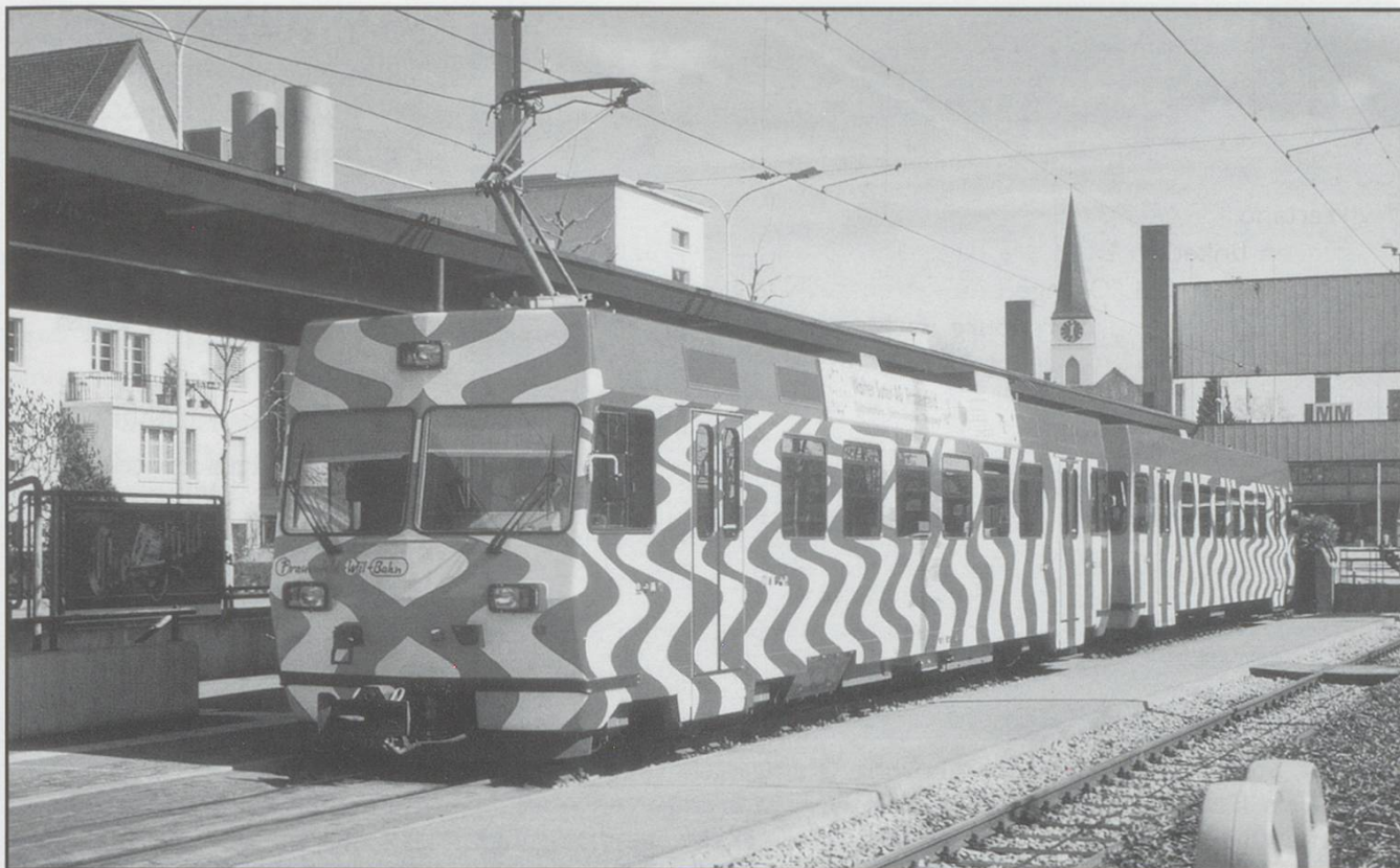
Another railway worth exploring: The Frauenfeld-Wil. One of its recently reliveried "red-zebra" railcars is seen here in Wil. The FW has its terminal just in front of the SBB station. 03/02. (Note from the editor: you can tell that today's designers aren't modellers, this wouldn't exactly be a breeze to replicate!)

equipment plus a German pantograph at each end. Now in the SBB Cargo livery as applied to the Re482, it is numbered Re 421 397.