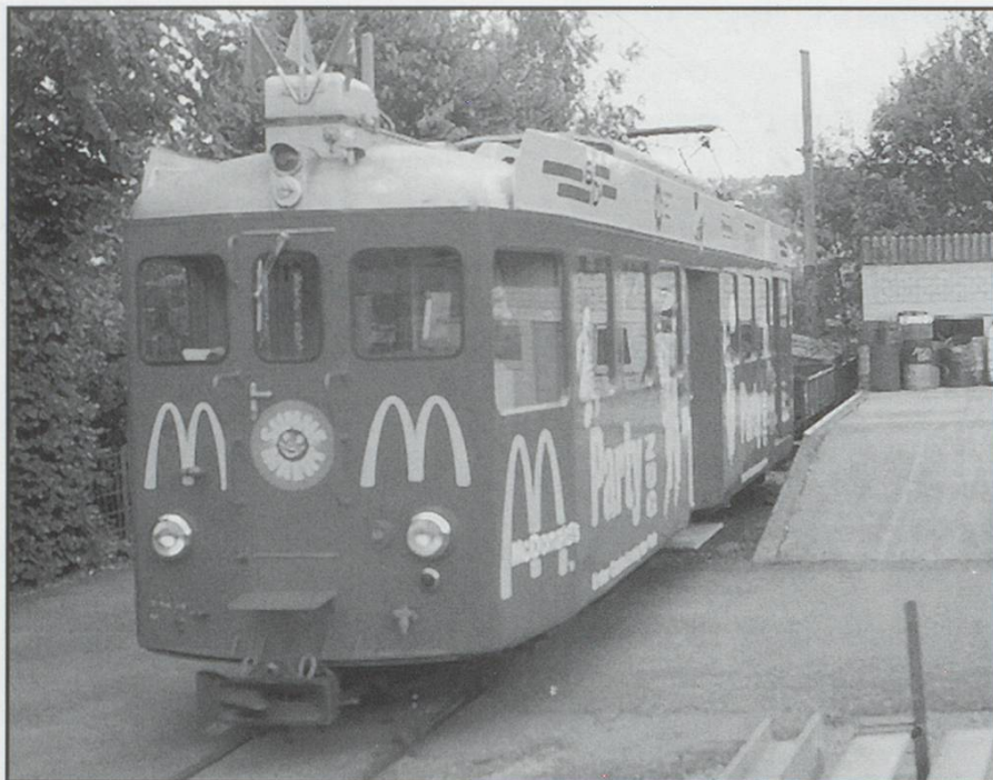
One of Steve Horobin's slides showing Bremgarten Dietikon Bahn Bde4/4 No. 11 built in 1932 in MacDonald's livery at Bremgarten West on 1st July 2001 on the occasion of 125th anniversary of the standard gauge Bremgarten West to Wohlen Line