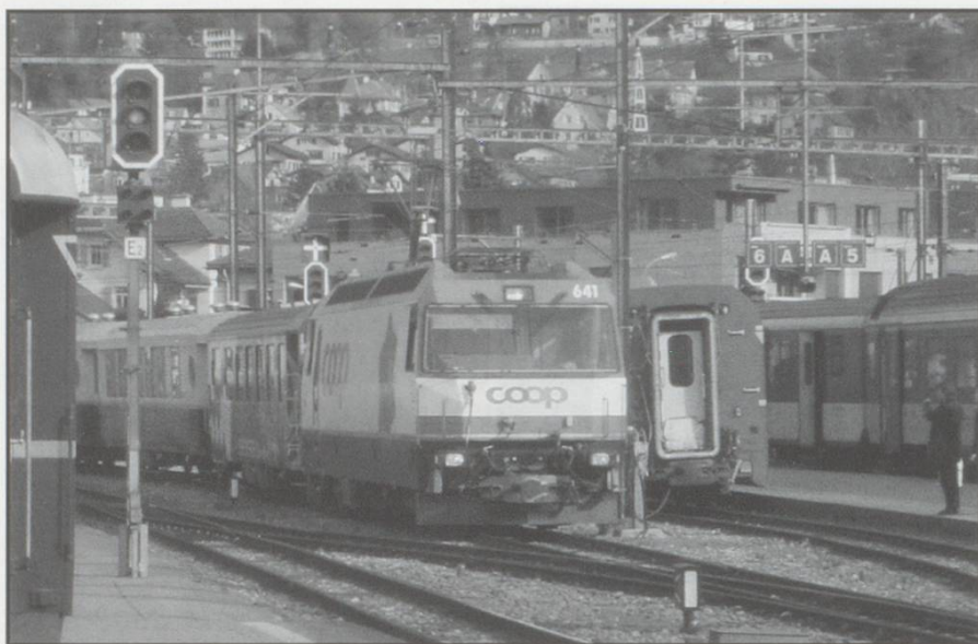
ABOVE: 641 shunting - After arrival from St Moritz, Ge 4/4 III no. 641 Maienfeld shunts onto empty stock at Chur, 23/01/2002