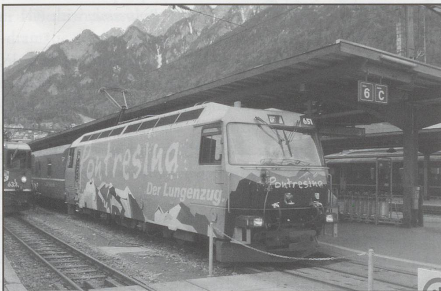
LEFT: Ge 4/4 III 651 Pontresina prepares to depart for St Moritz, 23/01/2002.

sional experience of shunting operations and the way SBB do it – an 8 coach train backing out of the station with apparently nobody at the leading end, and a driver happily driving his long train backwards at speed!