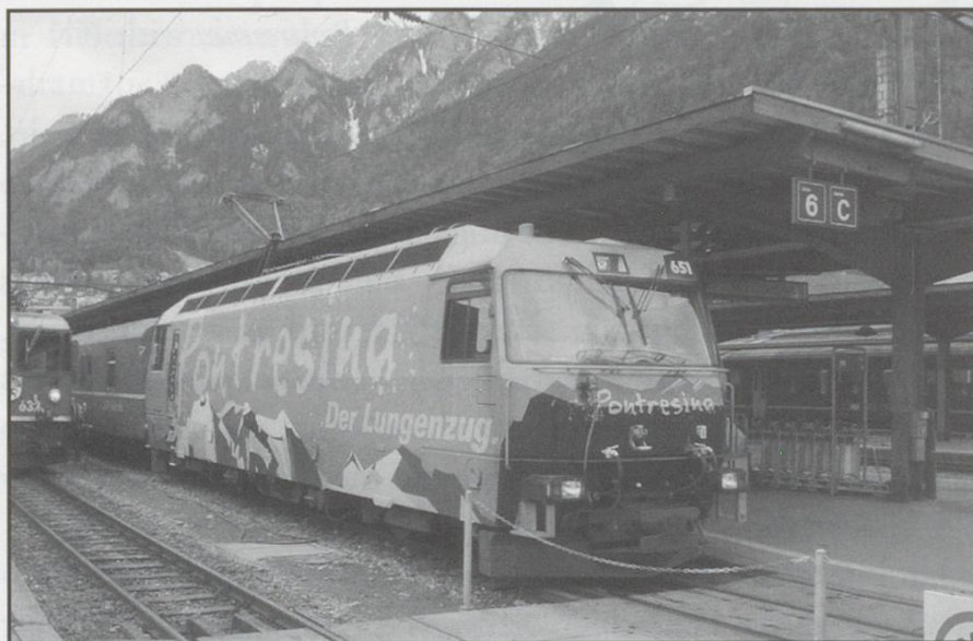
LEFT: Ge 4/4 III 651 Pontresina prepares to depart for St Moritz, 23/01/2002.

sional experience of shunting operations and the way SBB do it – an 8 coach train backing out of the station with apparently nobody at the leading end, and a driver happily driving his long train backwards at speed!