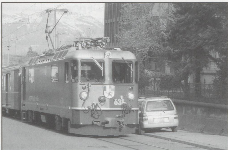
ABOVE: Street running – It seems that even the locals forget that trains cannot stop on a centime or swerve when they are confronted with a Ge 4/4! No. 631 Untervaz heads for Arosa on 23/01/2002, its driver totally unmoved by the encounter.

I left Heathrow without any definite plan for the time in Chur. BA ran to time (as, in my experience, it usually does) and taxied into the terminal at Zürich past sad lines of Swissair aircraft laid up awaiting their fate. On to a Lucerne train to Hbf – double deck stock with a red 460 – and change there for the Chur service. Approaching the main station I was reminded of one of the differences between my profes-