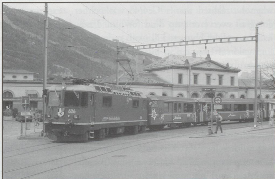
BELOW: Arosa Express forecourt – Ge 4/4 II 626 Malans heading the Arosa Express set awaits departure from Chur on the 1452 train to Arosa, 23/01/2002.

The Chur train was again a double-deck set with a 460 pushing, but with three coaches and a driving trailer at the leading end. A large number of people got out at Wädenswilj26