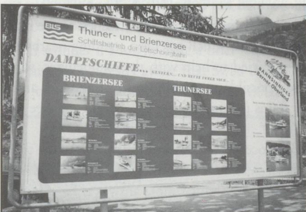
The new BLS notice board at Brienz.

The miniature steam train along the lakeside at Brienz. It must be possible to see four different types of steamers at once here. The Brienz Rothorn Bahn, the Ballenberg Dampfbahn, the BLS steamer and the miniature railway. No prizes but plenty of kudos for the first to succeed.