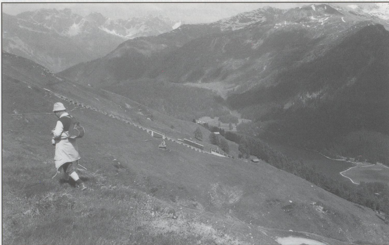
The Parsennbahn can be seen in the background from the path enroute to the Strelapass.

The other path from the Strelapass heads towards Langwies Station. The difficulty on this one lies in the initial descent over loose scree from the Pass. Other than that it's an easy stroll downhill all the way via Dörfli and takes just over 2 hrs. On return to Chur one has the