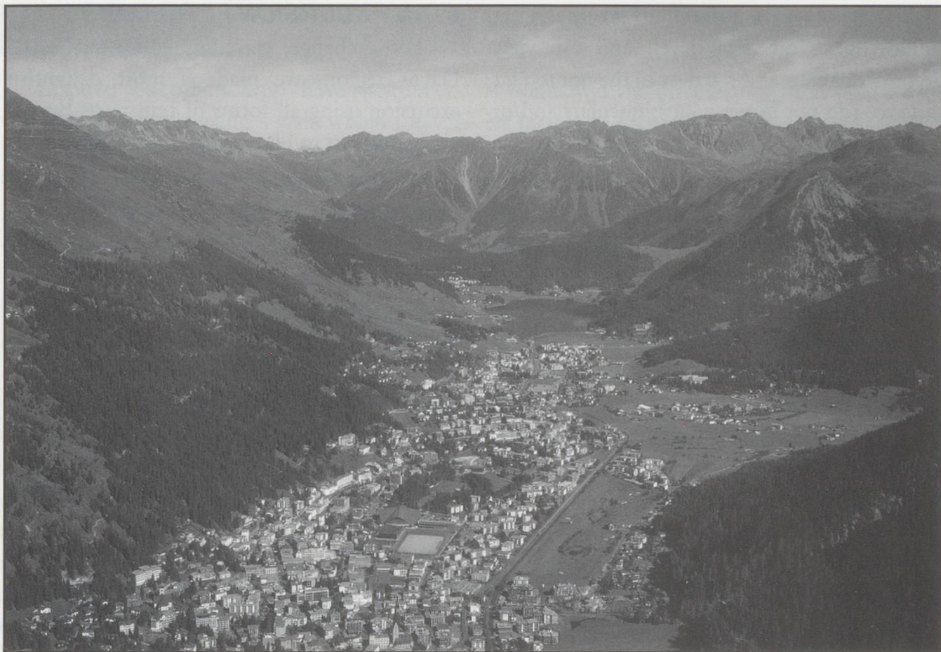
Bird's-eye view towards the north. In the foreground Davos-Platz with its sports and high altitude centre and (centre) Davos-Dorf with the lake. In the distance, the Wolfgang Pass and the alpine landscape around Klosters.