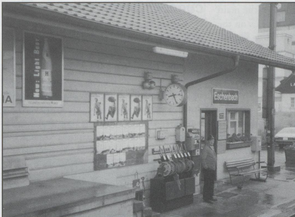
Eschenbach, 5/88. Note the old lever frame.