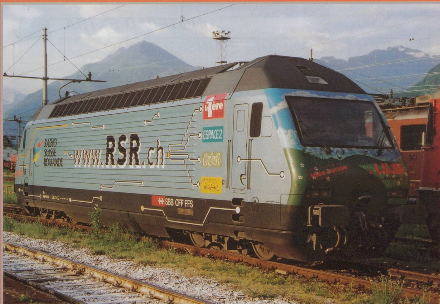
Above: SBB Re 460 012-8 in Radio Suisse Romande livery is snapped at Domodossola in the sidings waiting for the Italians to go back to work, it being a Sunday! 20/05/2001.