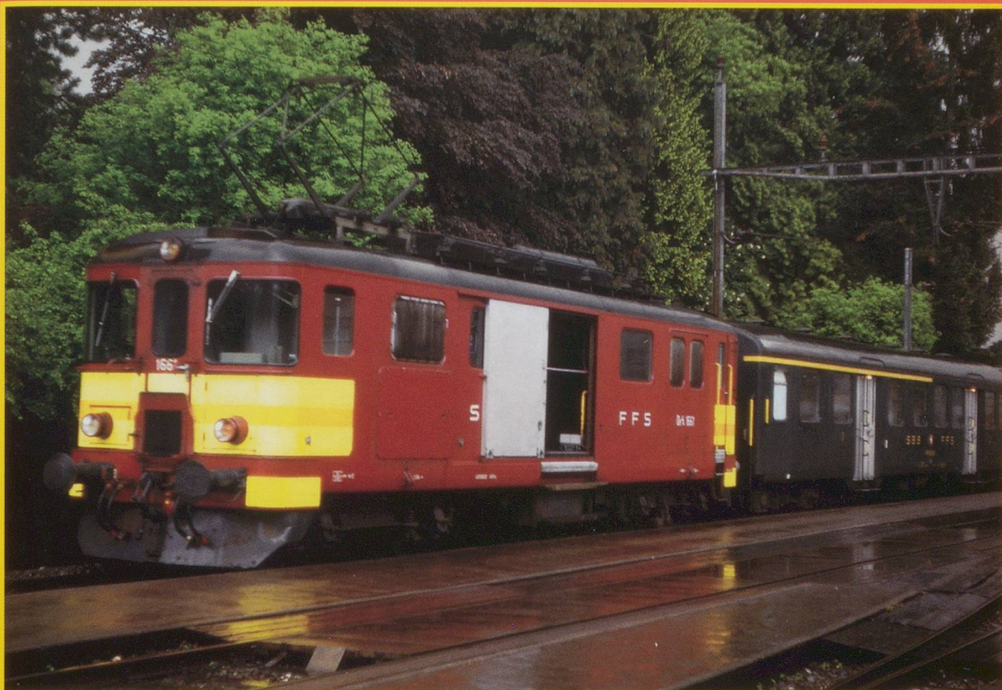
Above: SBB De 1661 arrives at Seon on the Seetal with the 1046 to Luzern. 11/05/1988. Below: One of the CF Jura's new Stadler railcars is pictured undergoing tests in the pretty Jura countryside. 6/2001.