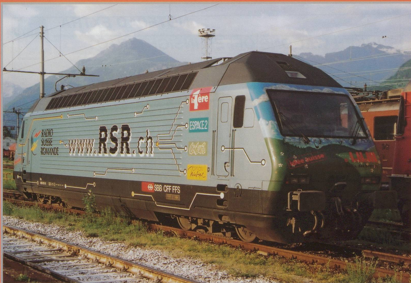
Above: SBB Re 460 012-8 in Radio Suisse Romande livery is snapped at Domodossola in the sidings waiting for the Italians to go back to work, it being a Sunday! 20/05/2001. Below: RhB "Croc" 407 at the east end of Disentis in September 1975.