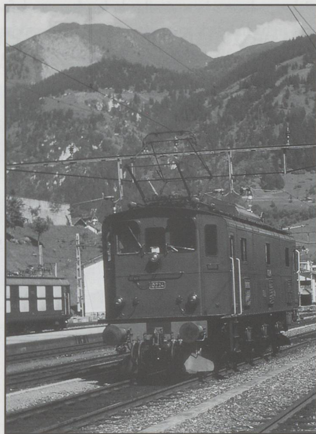
Of the several CFF classes fitted with Sécheron drive, the Ae 3/5 class was the smallest, its members sometimes being known as "Baby Sécherons". 26 of them were built between 1922 and 1925 by SLM and SAAS and spent most of their lives working in the French-speaking parts of the country. During the 1960s, 10218 10226 were modified to work car trains through the Gotthard and Simplon tunnels and one of these, 10224, was photographed at Airolo in the summer of 1967.

The final stage was to add the various detailing parts that come with the model. Although it is not necessary, I removed the body to do this and found it was a very tight fit on the chassis. The best way seems to be to ease