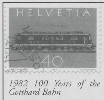
1982 100 Years of the Gotthard Bahn

In addition there have been air-mail series, stamps issued for use by soldiers on active service, and stamps given to charitable institutions and hospitals. Beyond that there are issues by United Nations and other Swiss based organisations. Special issues for use by mobile post offices in the 40s and 50s show postbuses of the era.