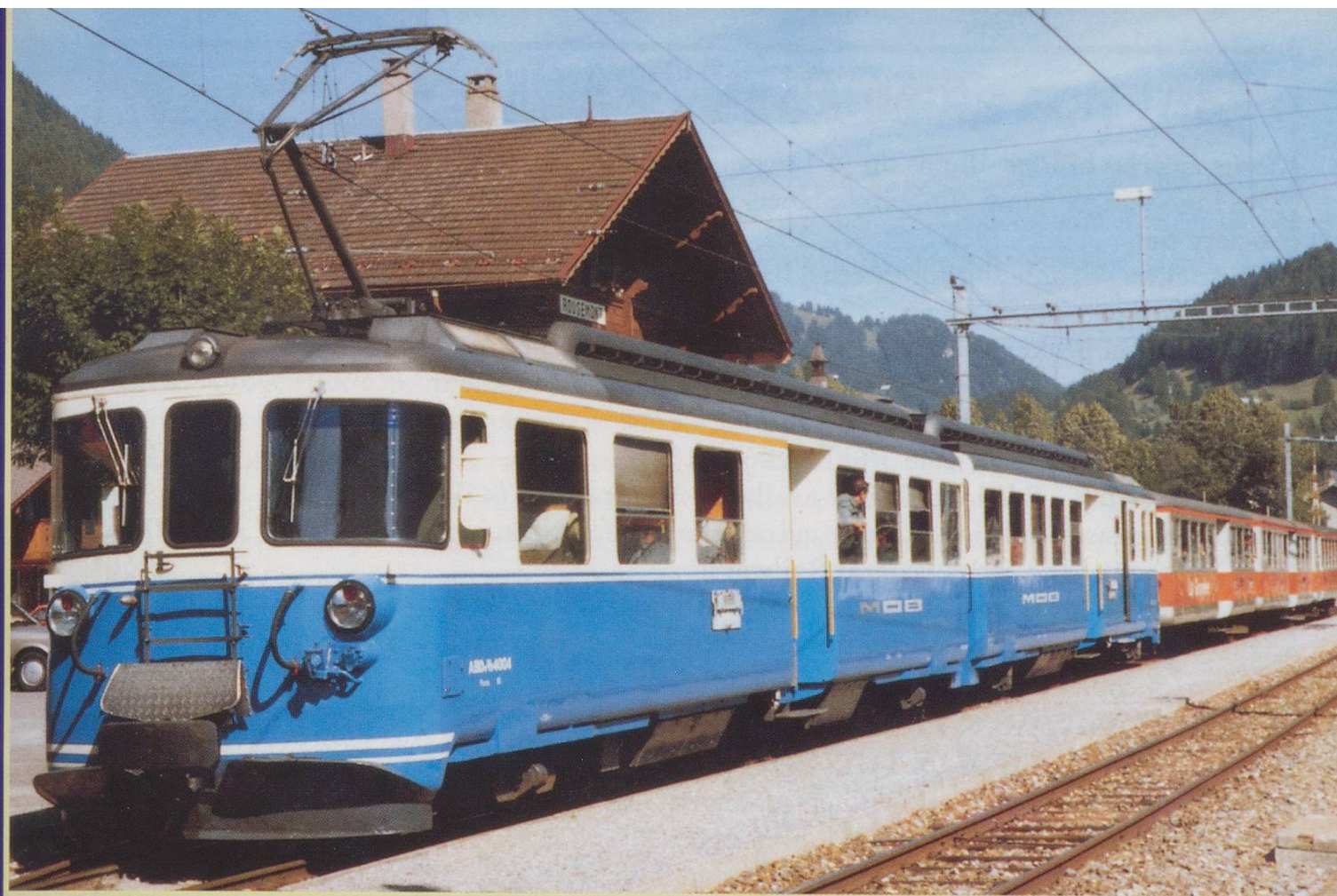
ABOVE: MOB ABDe 8/8 4004 heads some GFM stock at Rougemont. 6/9/1986. BELOW: I think it may have snowed a bit. Beat's favourite weather? Two completely unidentifiable BDe 4/4s at Rougemont.