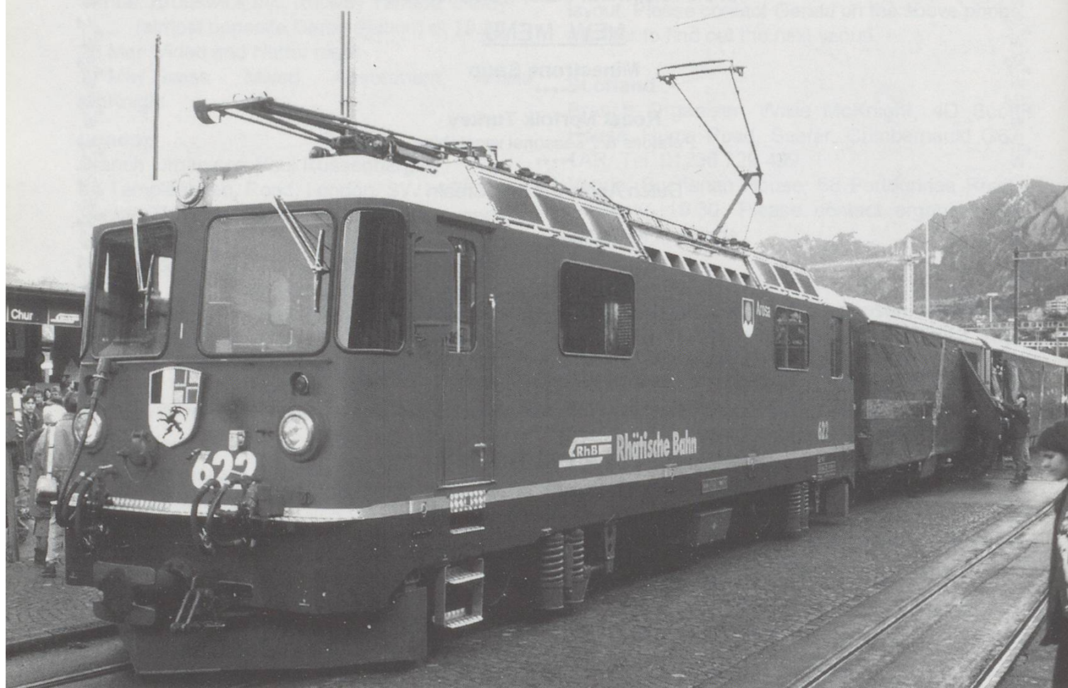
Opposite page: The new Bt 1703 having the 'gift wrapping' taken off in Chur station.