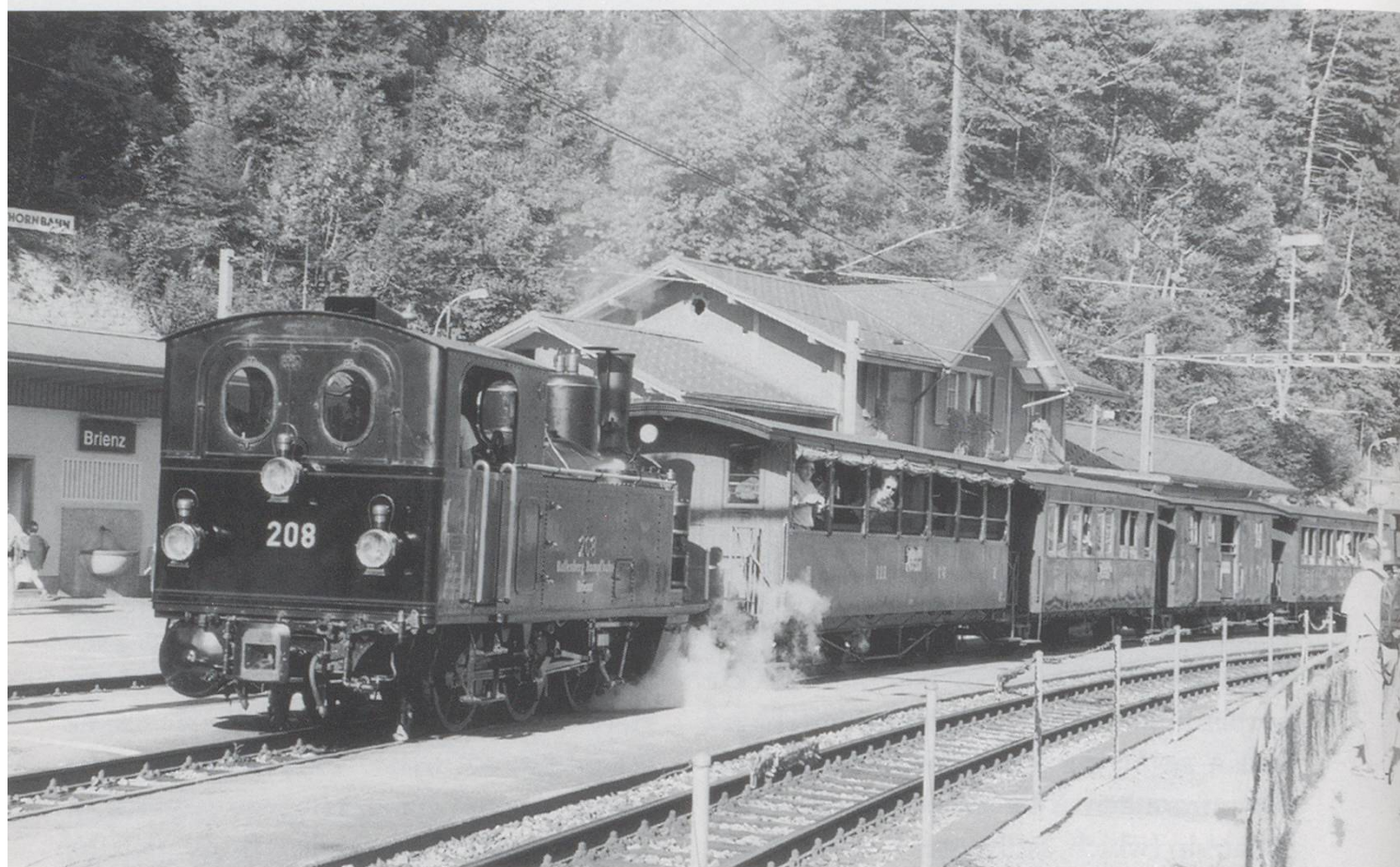
208 rests at Brienz in September 1997