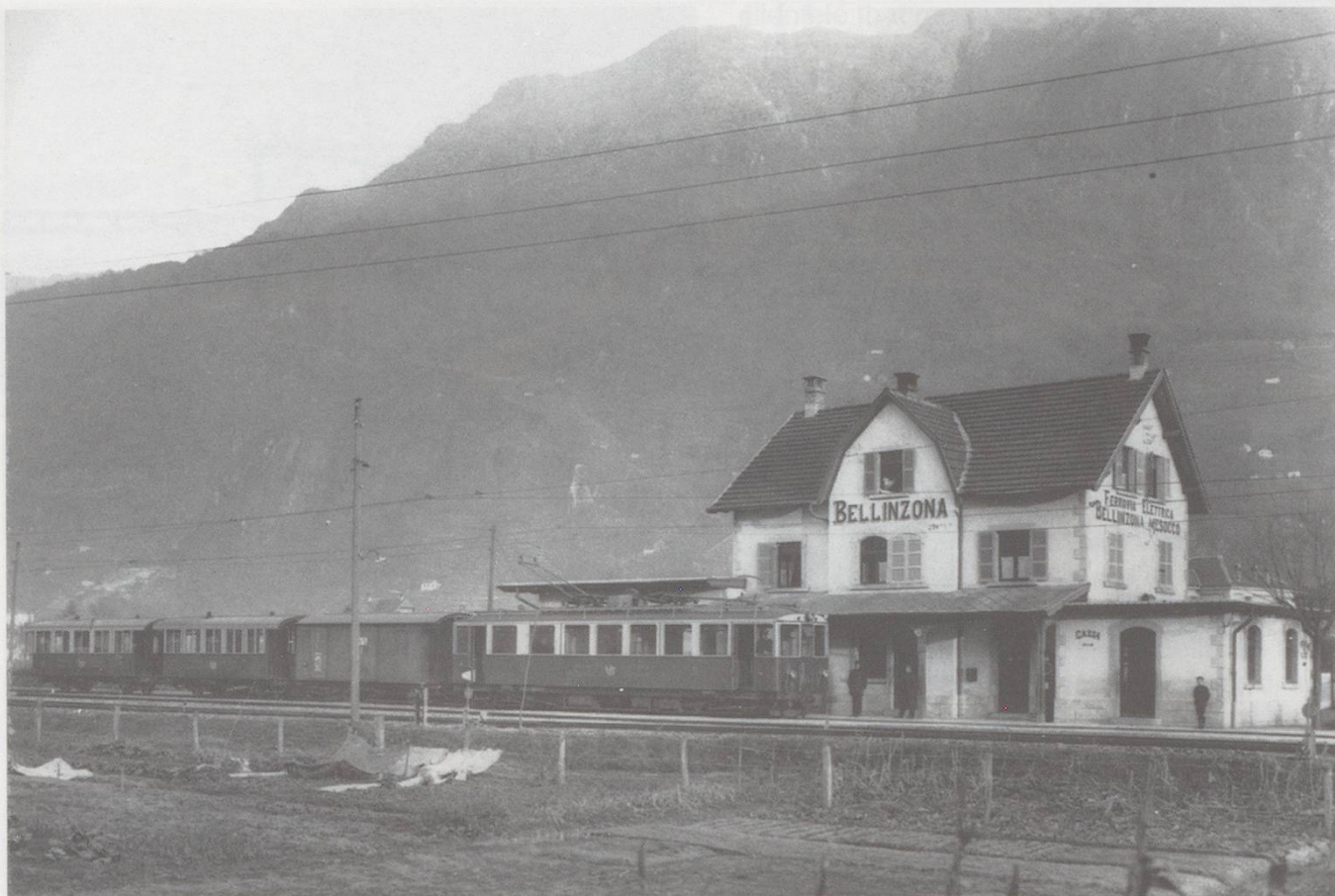
Bellinzona Mesocca Bahn. Railcar BCe4/4 arrives in Bellinzona.