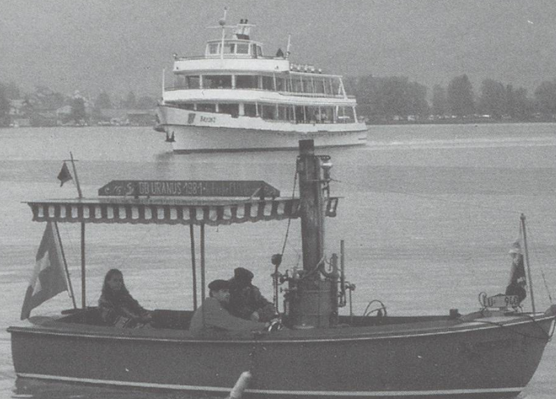
Above: Steam launch at Brienz "MS Brienz" behind.