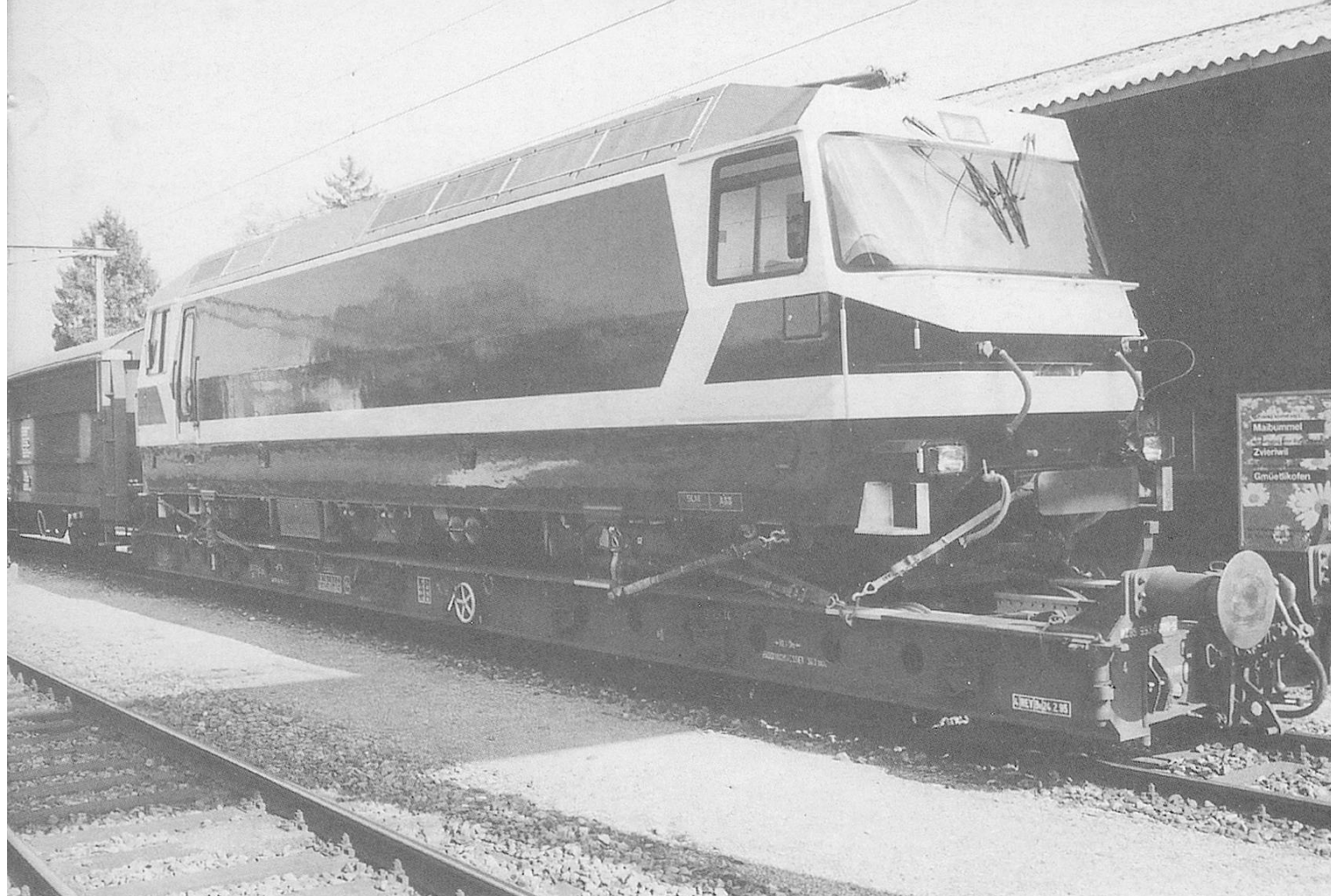
Above: Ge4/4 8002 on its way from SLM seen here at Zürich Seebach station.

the line, but not my last. One interesting point to note is the large assortment of goods vans in advertising livery that brighten up the stations as you pass through.