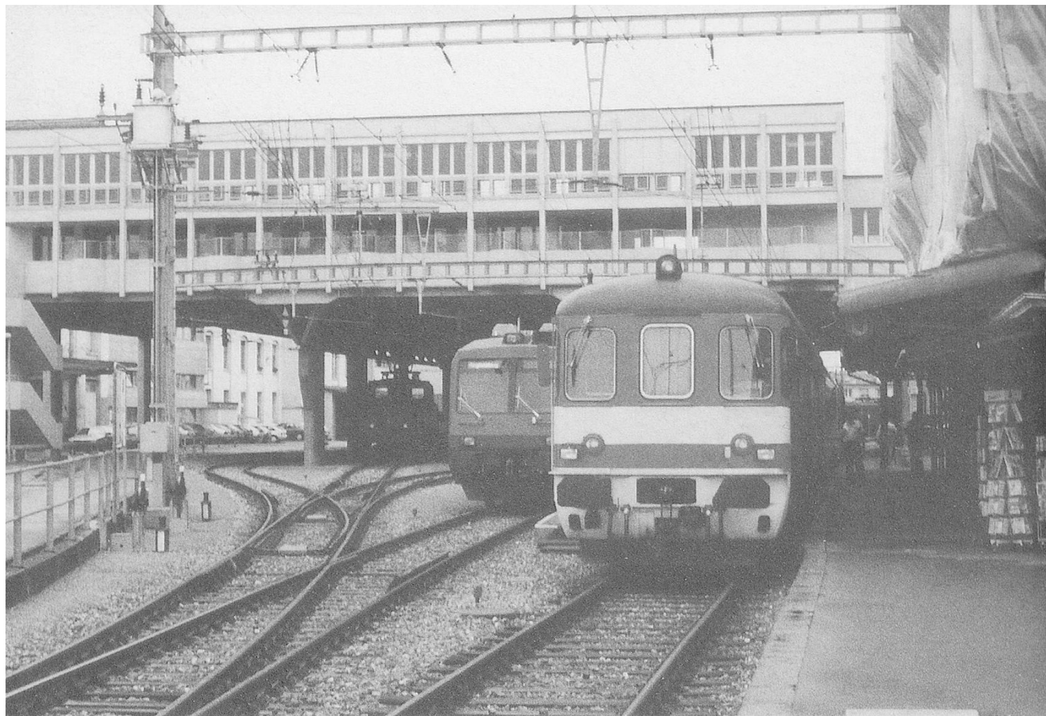
Above: Hochdorf station the Ee3/3is just visible