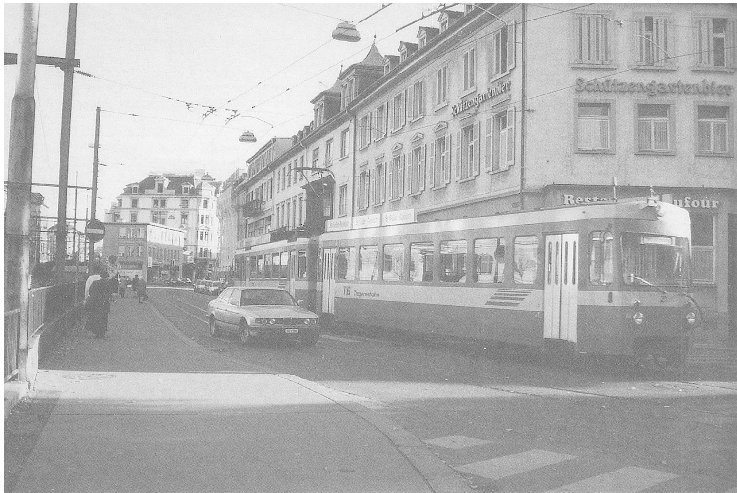
Previous page: Appenzellerbahn No.46 at Wasserauen Above: The Trogenbahn at St. Gallen.