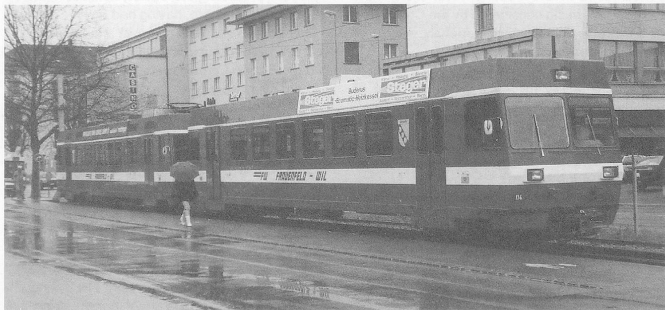
Below: The Frauenfeld-Wil, at Frauenfeld