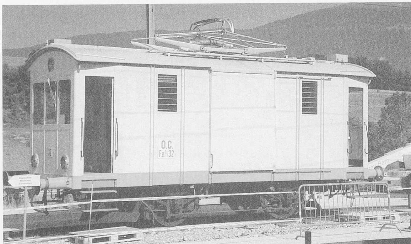
Above: Orbe Chavornay Fe 2/2 No. 32 at Orbe. Below: The exotic flowers on No.14's bulkhead.

the double tracks by means of a swivelling "bridge", the most unusual fiddle yard I have ever seen. On our arrival we were treated to a demonstration of why, even with radio control, it is not a good idea to have two trains on one circuit, a freight train headed by an Aster "King" rammed the back of a pick-up goods behind an Aster pannier. Three wagons descended a metre to the floor.