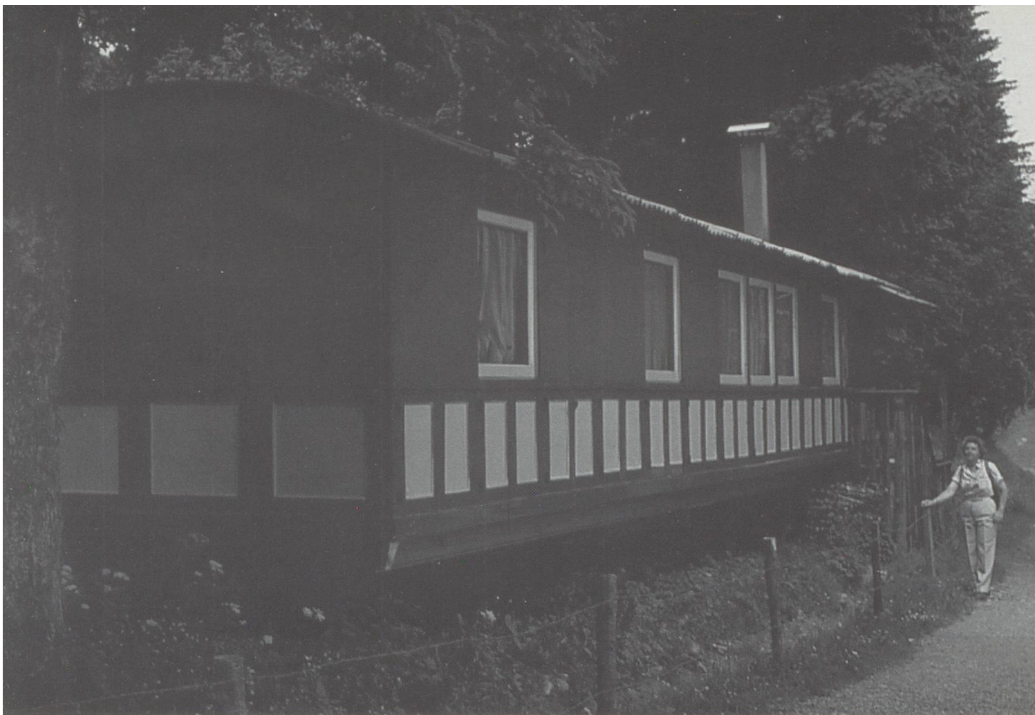
Above: The old coach of the Rigi-Scheidegg Bahn referred to in Swiss Express vols. 4/7 & 4/8