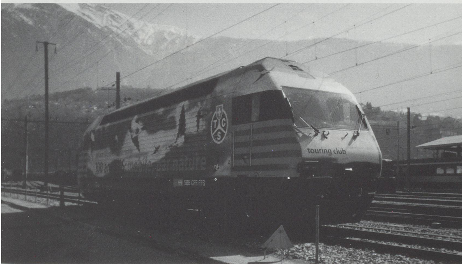
Below: The latest livery on Re460-022 for TCS seen here at Brig on 11th March 1996, photo by Steve Horobin.