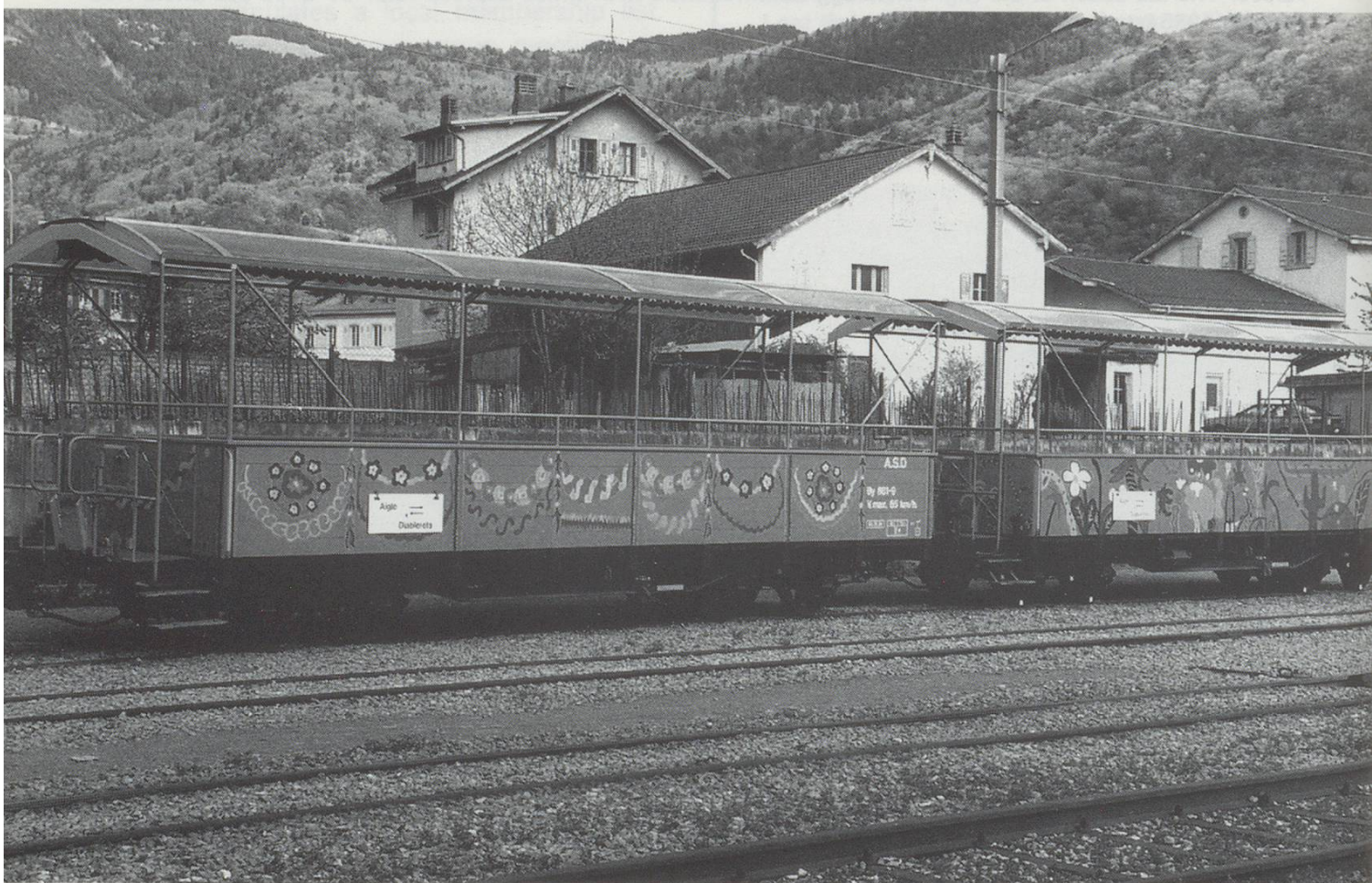
Below: The two open coaches obtained from the Brünig line now in service on the Aigle-Sepey-Diableret (ASD)