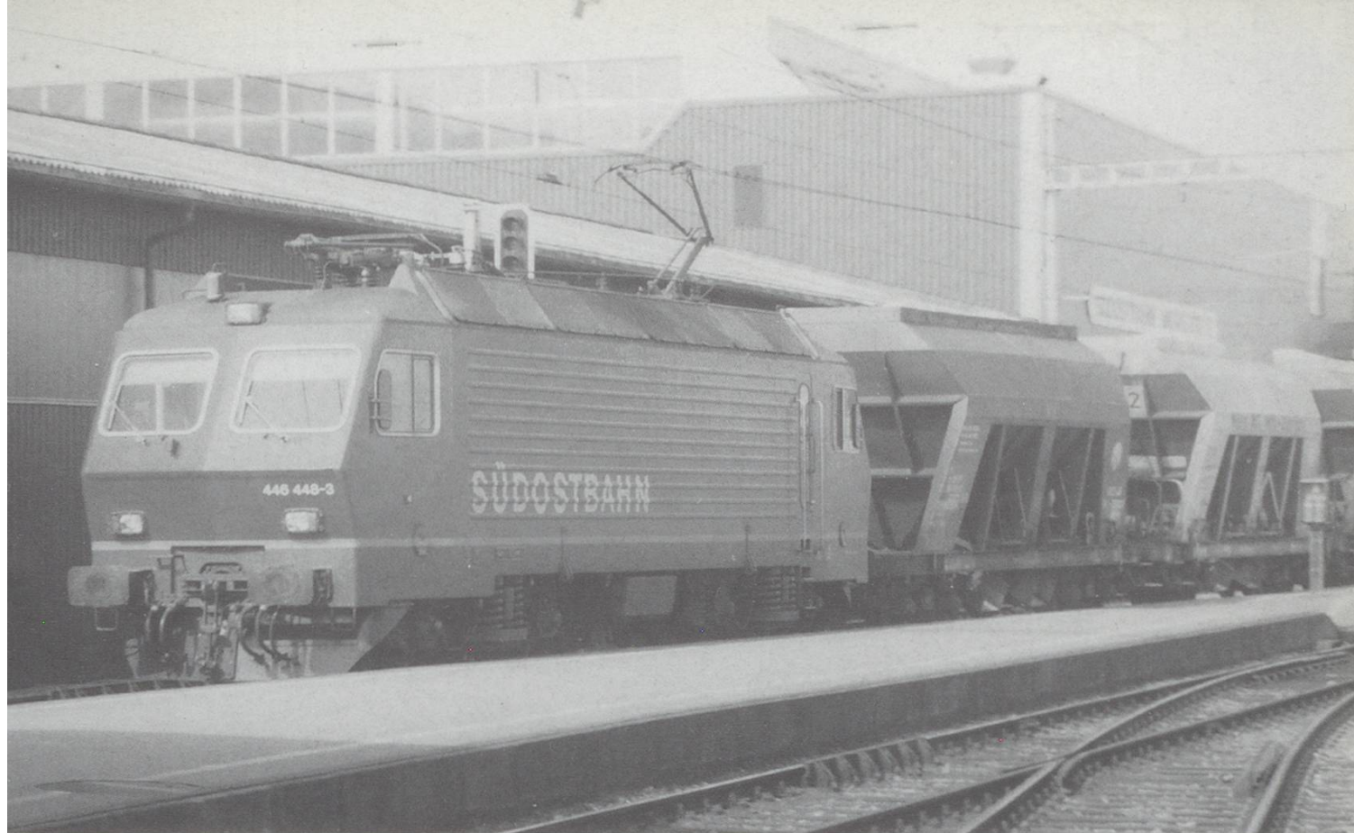
Above: Now repainted in SUDOSTBAHN livery, Re4/4 446 448-3 seen here with a goods train in September 1995.