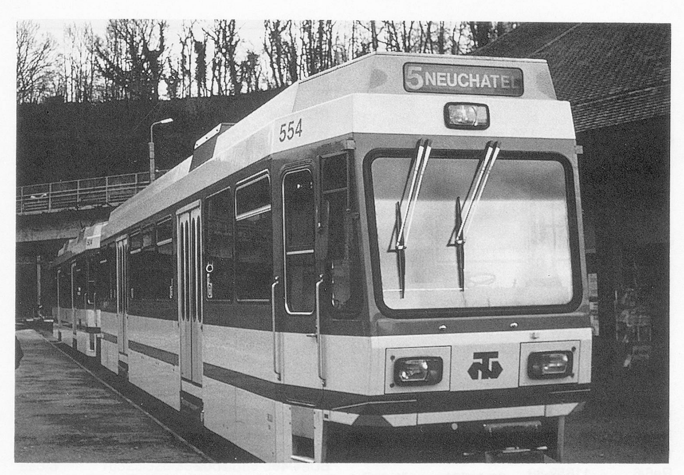
TN Bt No 554 at Boudry, on the No.5 route to Neuchâtel 24 March 1992

We passed through two long tunnels to emerge at La Chaux-de-Fonds, where connections are made to two metre gauge lines, the Chemins de fer du Jura (CJ) and the Chemins de fer des Montagnes Neuchâtelois (CMN) as well as the CFF secondary line from Biel. A straight, slightly climbing run out of La Chauxde-Fonds brought me to La Locle, the terminus for the Swiss services.