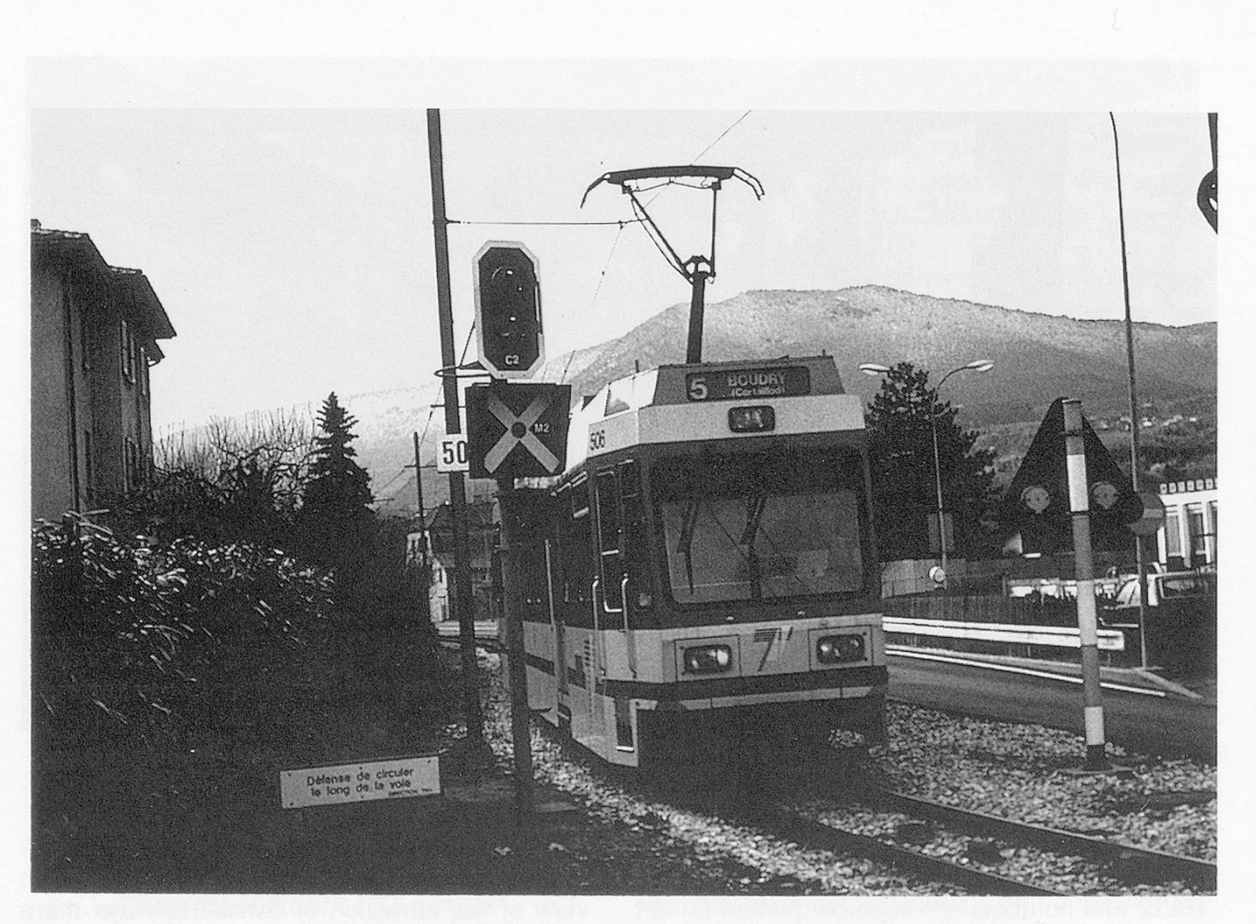
Boudry bound TN Be4/4 No.506 on No 5 route at la Tuilière-Areuse, 24 March 1992