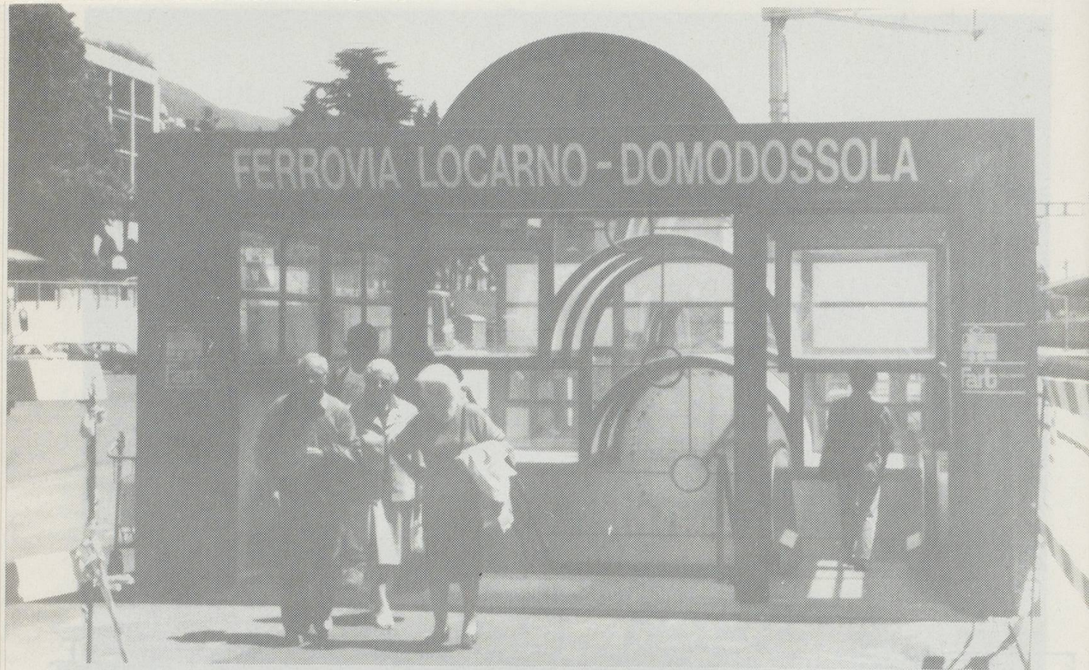
Above: The entrance to the new underground Centovalli line station at Locarno, 11 June 1991.