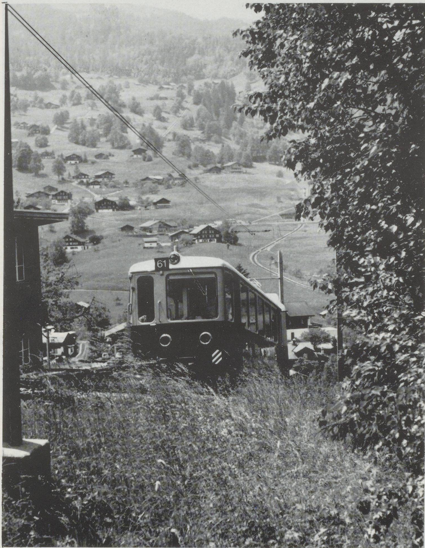
Grindelwald-Grund train of the WAB on 9 June 1980.