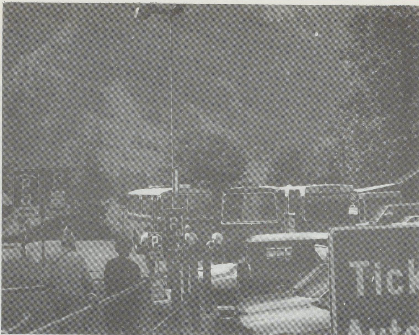
Post Auto station, Grindelwald.