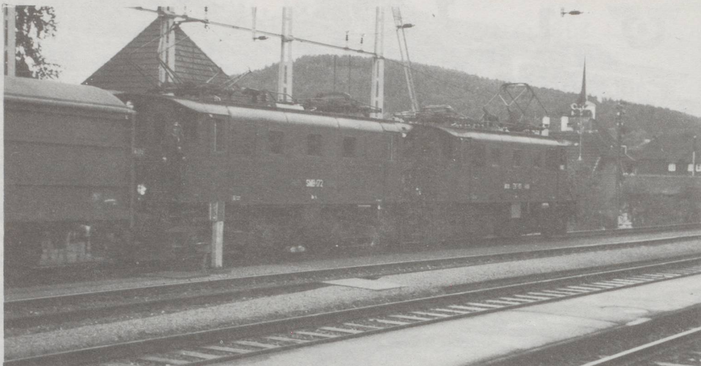
A pair of Be4/4s run through Konilfingen on a Hasle-Ruegsau to Thun freight.