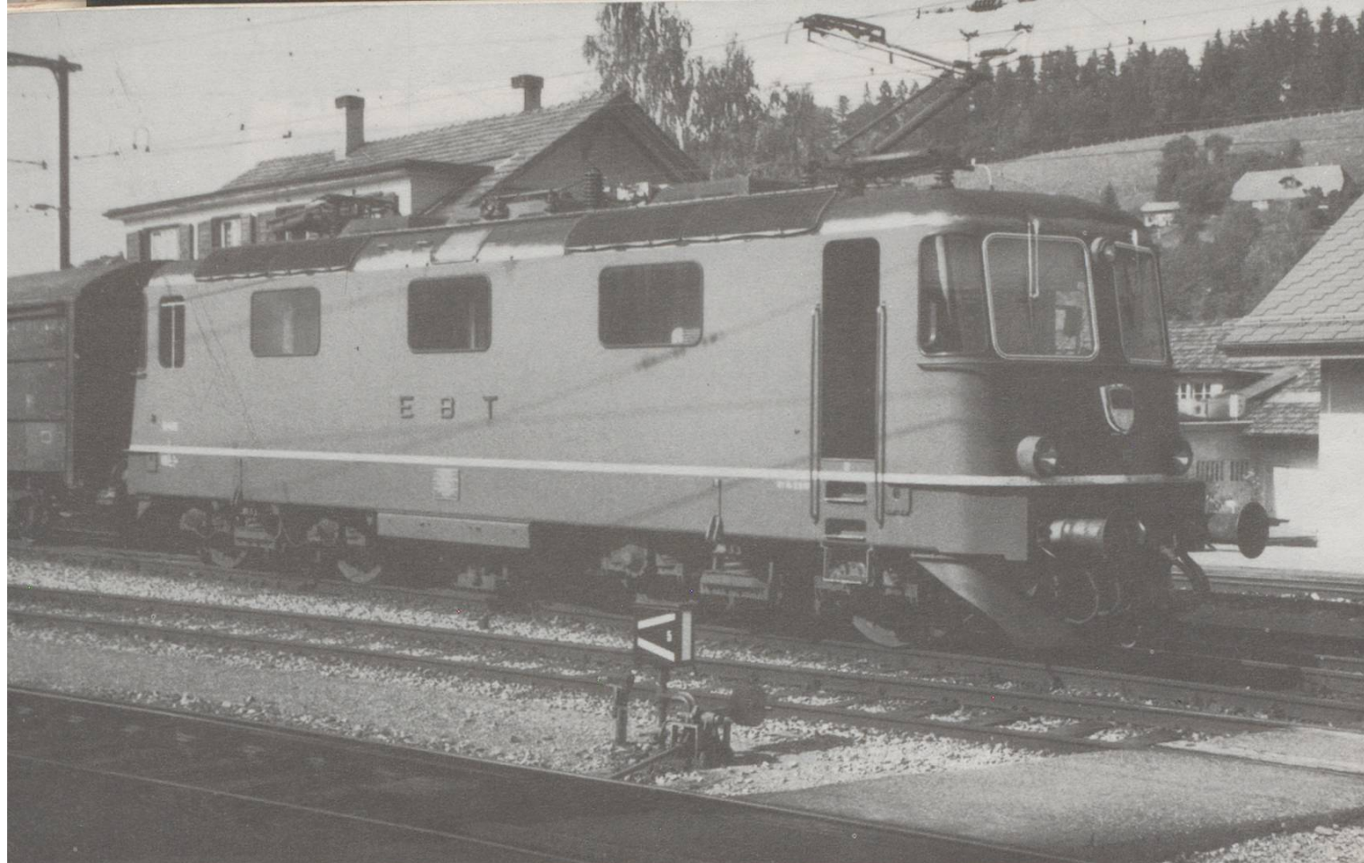
EBT Re4/4'' No. 112 at Huttwil.