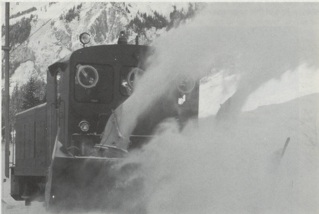
Snowplough Xrotm No.101 hard at work on the Lötschberg.

foreigners believe, it is not the north side which has the highest rate of snowfall per day. For instance, Göschenen, altitude 1105.8 metres, has measured a highest rate of snowfall of 0.90 metres in one day. Whereas, Airolo, altitude 1141.5 metres, at the south portal of the Gotthard tunnel measured a fall of 1.60 metres in one day. On the Bernina line which crosses the Bernina Pass at an altitude of 2253 metres, the snowfalls have attained 2.20 metres in one day. But here the problem is aggravated by the high winds building up snow drifts of considerable depths. It is not unusual to measure snow depths of more than 10 metres, depths of 7 metres building up through the winter are common.