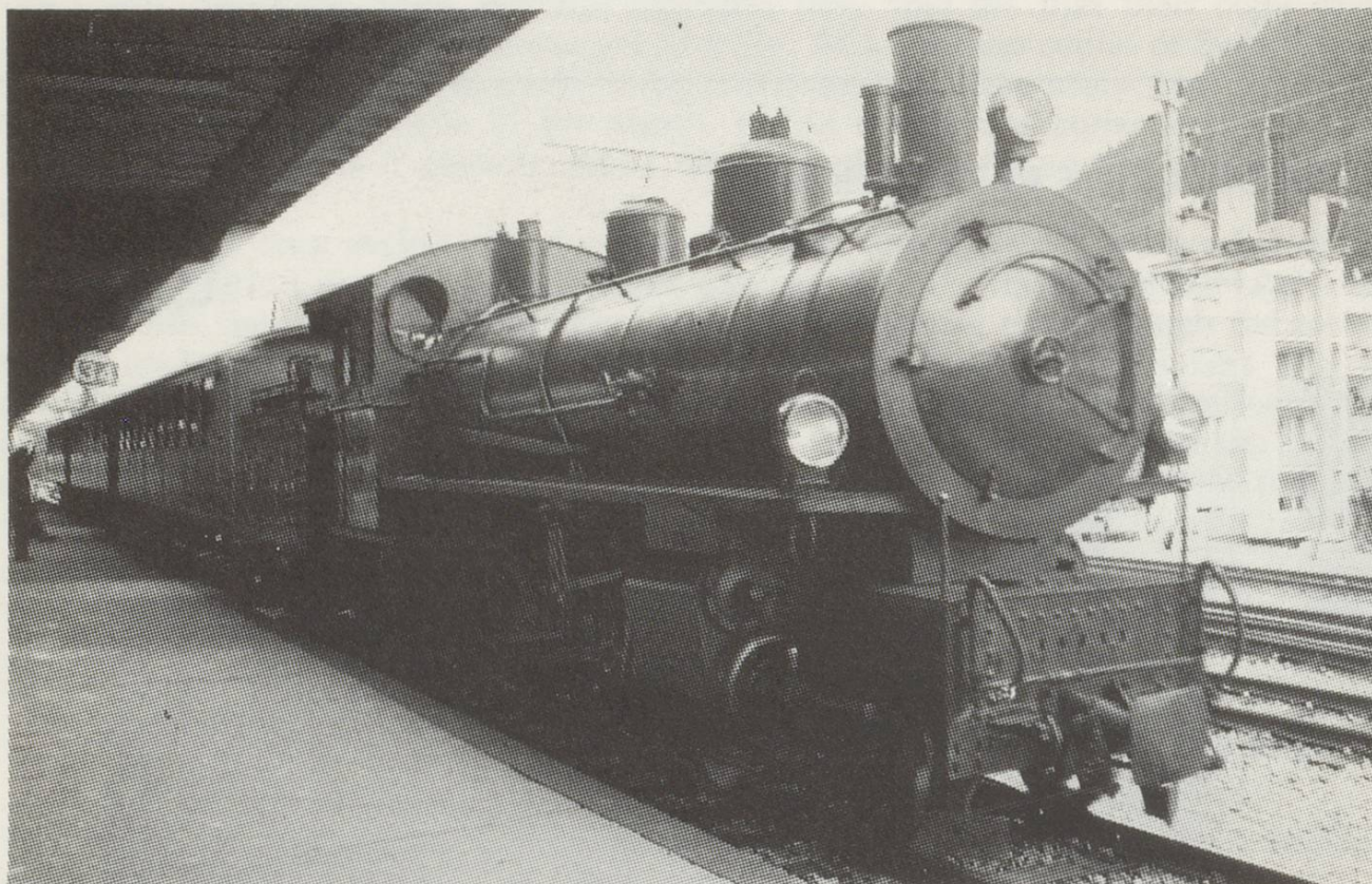
G4/5 No. 107 with special excursion.

The Rhätische-Bahn (RhB) is the largest of the privately owned Swiss narrow gauge railways. It operates in the south-east canton (province) of Graubünden and features 395 km of line with 115 tunnels totaling 38.6 km. There are 485 bridges with a total length of 12 km. It is a true model railroad in 1:1 scale, and the combination of picturesque scenery, frequent service and narrow gauge is an attraction too strong to be missed.