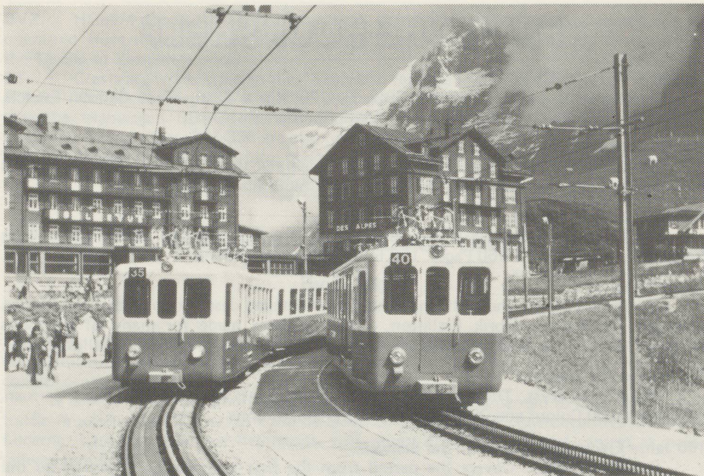
JB. BDhe2/4's at Kleine Scheidegg