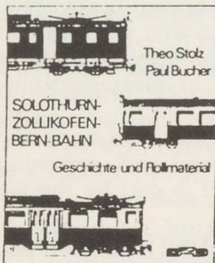
Solothurn Zollikofen Bern Bahn. By Stoelz. German. 160 pages. 170 photos. SFr26.10/£10.40

100 Jahre Elektrische Bahnen in der Schweiz. By Trueb. 168 pages. 100 photos. German. SFr57.60/£23.00