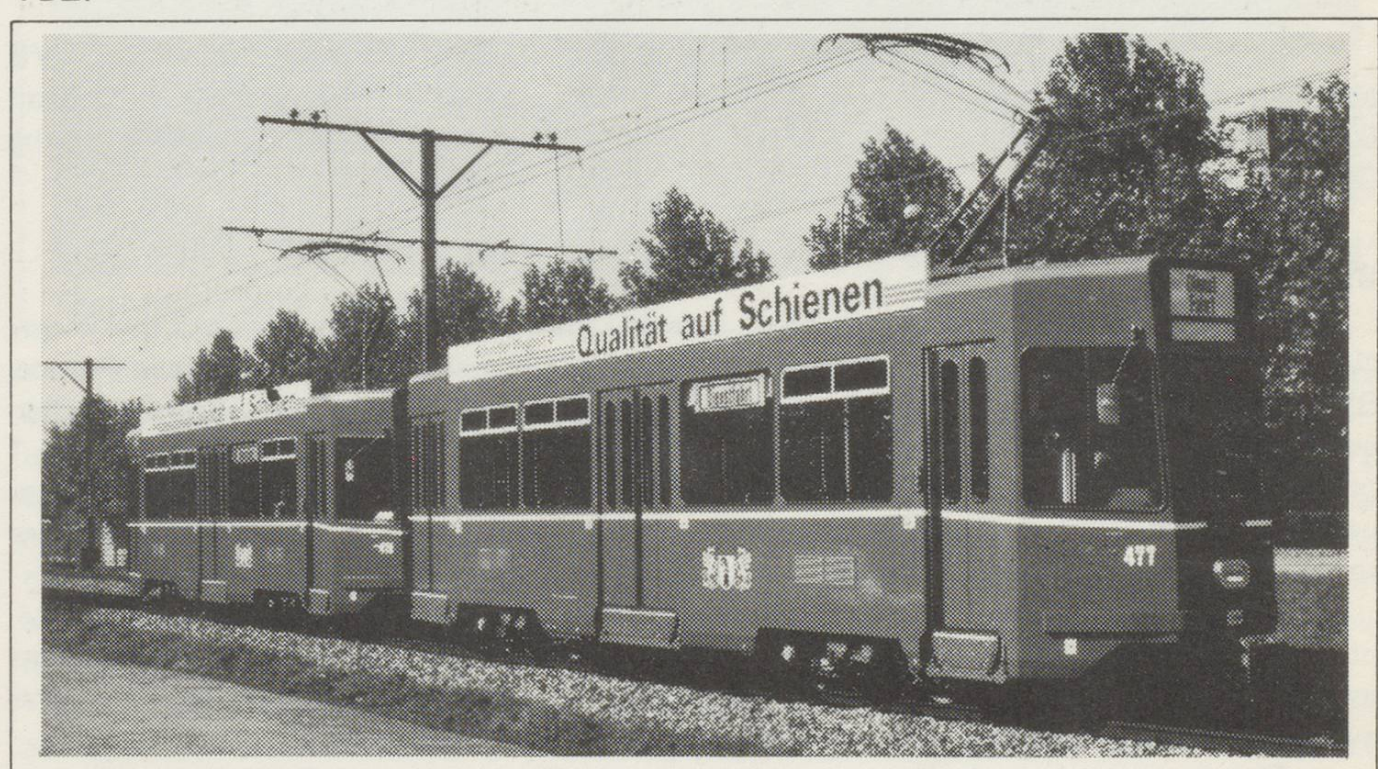
New articulated tram unit.

Distinguishing a tramway from a light railway is a difficult task although there are distinctions in Swiss law. A recent example would be the conversion of the BLT line 17 from a light railway to tramway status, but the differences are not always obvious and in places the new incarnation more resembles a railway than before. For the purpose of this article I am keeping to the five urban areas of Basel, Bern, Geneva, Neuchâtel and Zürich. Although this list is fairly widely accepted it does lead to at least one contradiction: the remaining line of the Neuchâtel system has less street running than Zürich's Forchbahn (FB) which is classified as a railway, whilst using near identical new generation rolling stock and the FB has a significant amount of street running over the VBZ.