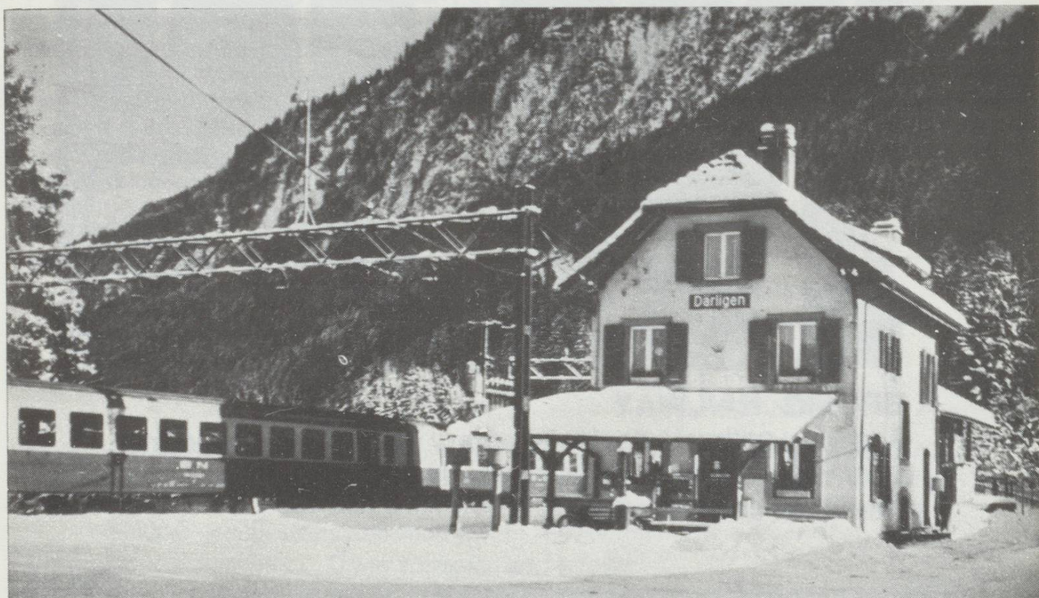
Station building at Darligen.

Trains bound for Interlaken use platform number 1 at Spiez. The route out of the station area is fairly straight, dropping from the main line which bears away on a sharp curve to the right. A recently built feeder station and a new under-line road bridge are so arranged to allow a second running line to be laid as far as the first stop at Faulensee. This is a pleasant little station with a loop and single siding (see rough layout plan). To judge by the film of rust on the rails, the loop does not see much use.