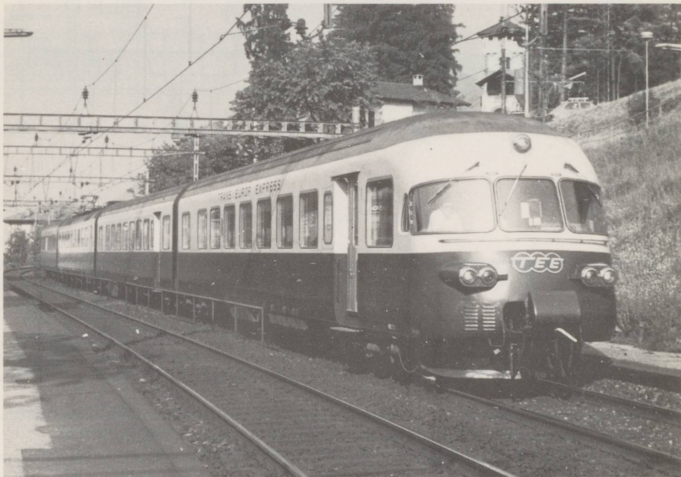
RAe TEE unit no. 1054 races through Lugano Paradiso with the northbound "Gottardo" May 1981.

It is difficult to judge accurately the length of the individual vehicles. The drawing usually used by publications gives only the length over body, but part of this length is hidden by the inter-coach air-smoothing, I estimate this hidden part to be about 250mm at each inner end, giving the lengths I have quoted in the table.