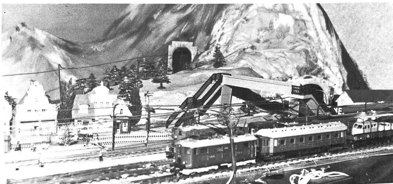
Cotine and tunnel entrance – Oberderbiggun.

An imaginary trip on the line will illustrate the character of the system and if ever you find yourself in the town of Rocesse, take a walk up the Rue de Remarque (rude remark) leaving the cathedral on your right and enter the terminus station. Here we can take a local stopping train to Cotine after admiring the international expresses drawn up under the train shed. We leave from Voie 4 passing the goods yard and loco depot, and thread the short tunnel under a spur of the alps, which brings us to the 1 in 50 climb through lush farming territory and past the Ozen industrial site. At the top of the climb we pass the church of St. Bingo who is a sincerely regarded character revered by many followers in Britain seeking financial blessing !