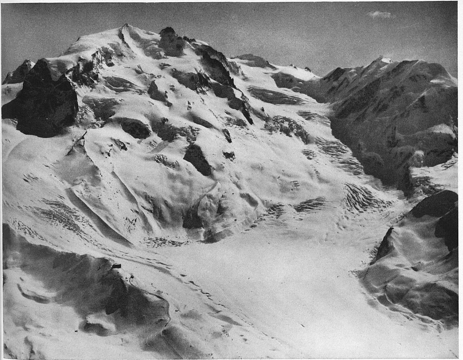
Top: To the rear of Zermatt's mountain setting, Monte Rosa and the Lyskamm raise their proud summits. In foreground of picture, the Gornergrat. Oben: Königlich erheben sich im Hintergrund der Zermatter Gebirgsumrahmung Monte Rosa und Lyskamm. Im Bild-Vordergrund der Gornergrat. Ci-dessus: Derrière l'amphithéâtre des montagnes de Zermatt se dressent majestueusement le Monte-Rosa et le Lyskamm. Au premier plan le Gornergrat.