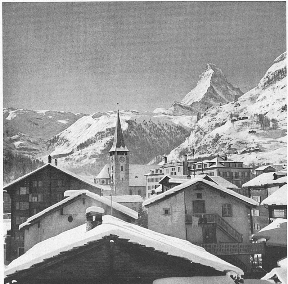
Right: Zermatt's winter costume. Rechts: Winterliches Zermatt. A droite: Zermatt sous la neige.

Photo: Swissair. - Aus dem Buch «Flugbild der Schweiz» (Mühlrad-Verlag).