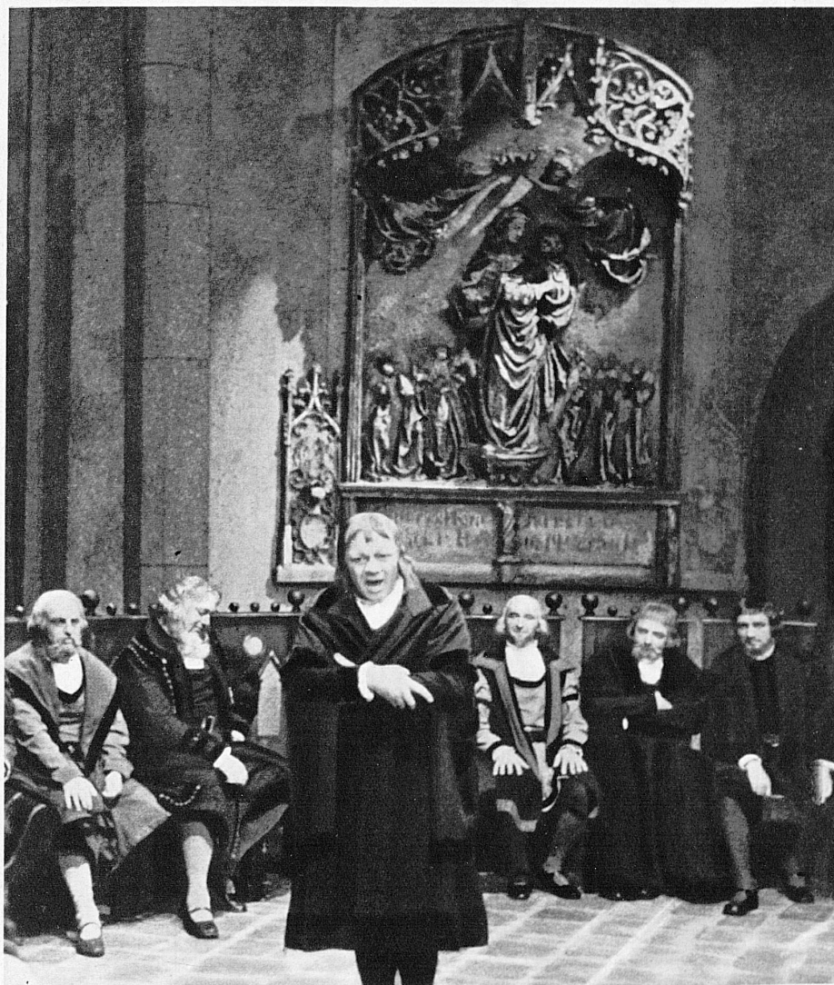
The «Meistersinger» by Wagner, Zurich Opera (stage setting by Clemens) — Les «Maîtres chanteurs» de Wagner à l'Opéra de Zurich (mise en scène de Clemens) — Wagners «Meistersinger» in der Zürcher Oper: (Bühnenbild von Clemens) — I «Maestri cantori» di Wagner all'Opera di Zurigo (Scenariò di Clemens)

Berne may be the Capital of the Swiss Confederation, but it is far from being the stately pile of conglomerate architecture one might be led to expect from a Seat of Government. For the typical features of Berne — apart from the famous Bear Pit — are her leafy bowers and her patrician houses, her decorative fountains and turrets, all of them very old, built by a people that once ruled the land from Mont Blanc to the Rhine. A stroll through the ancient city is a veritable voyage of exploration and discovery; it arouses a childish glee, a wonder that such things still exist. The Bear, Berne's symbol, is to be seen everywhere in one form or another; you will not be the first to buy one in hazel-nut sugar and then wonder whether to eat it at once or keep it as a souvenir. Hans von Berlepsch-Valendas.