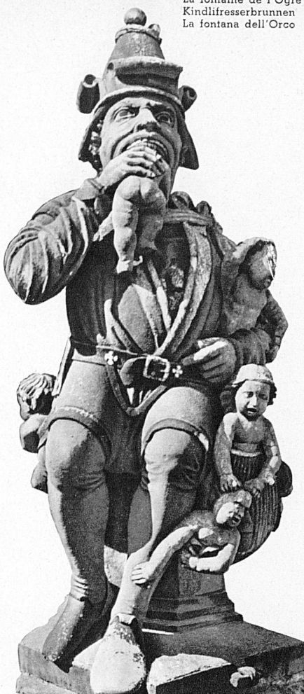
Bern: «Bogey-man»-Fountain La fontaine de l'Ogre Kindlifresserbrunnen La fontana dell'Orco