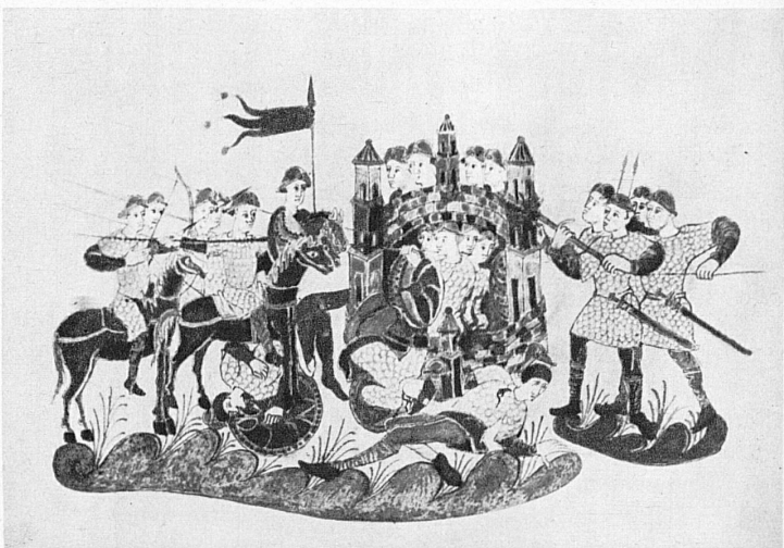
Miniature from the Codex XXII, «Psalterium aureum» (Monastery library, St. Gall) — Miniature du Codex XXII, «Psalterium aureum» (Bibliothèque de l'Abbaye de St-Gall) — Miniatur aus Codex XXII «Psalterium aureum» (Klosterbibliothek, St. Gallen) — Miniatura dal Codex XXII «Psalterium aureum» (Biblioteca dell'Abbazia di San Gallo)