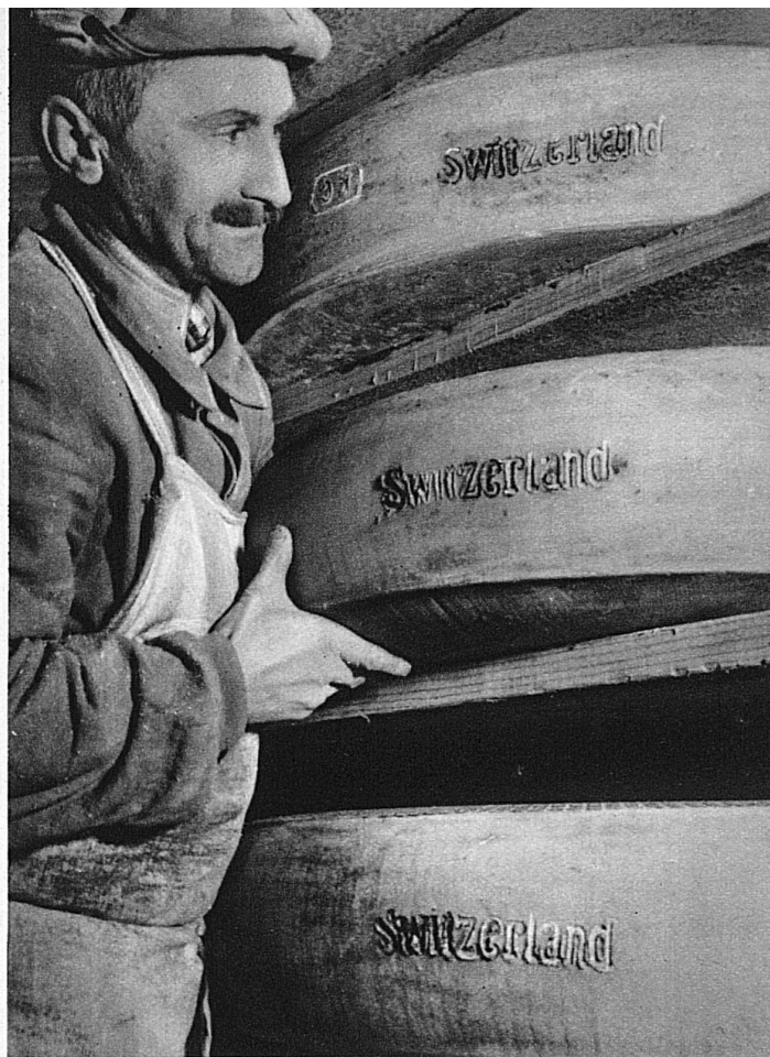
Ready for export

As regards the former, these loaves are manufactured in rural cheese factories which exist in nearly every Emmenthal village and are run by a certified cheese-maker and an assistant, both of whom have usually been trained in the Federal School of Agriculture. These factories are, as a matter of fact, merely small houses, with well-scrubbed tiled floors, spotless deal tables and enormous, polished brass vats. Contrary to what occurs in the Gruyère, the Emmenthal farmers hardly ever make the cheese themselves, but content themselves by selling all their milk to the factories, where the cheese can be produced under the most approved conditions of modern hygienic requirements. As a general rule