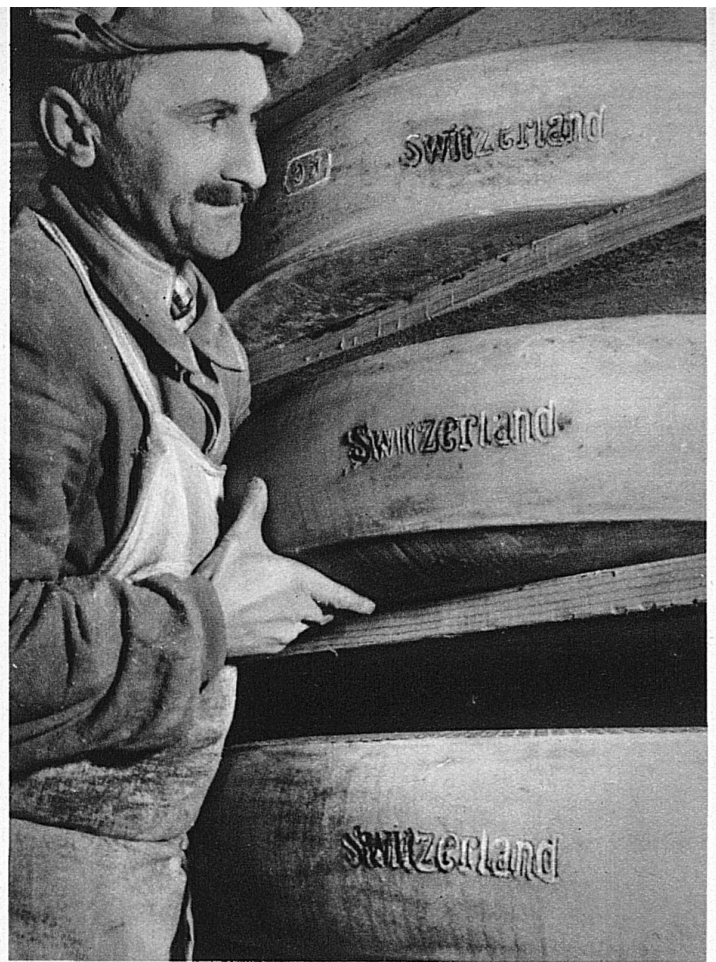
Ready for export

As regards the former, these loaves are manufactured in rural cheese factories which exist in nearly every Emmenthal village and are run by a certified cheese-maker and an assistant, both of whom have usually been trained in the Federal School of Agriculture. These factories are, as a matter of fact, merely small houses, with well-scrubbed tiled floors, spotless deal tables and enormous, polished brass vats. Contrary to what occurs in the Gruyère, the Emmenthal farmers hardly ever make the cheese themselves, but content themselves by selling all their milk to the factories, where the cheese can be produced under the most approved conditions of modern hygienic requirements. As a general rule