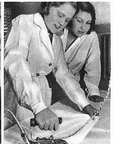
Life is a happy medley of arts and handicrafts

flocked in large numbers. The 17th Century was famous for its architects and painters, beautiful examples of whose work are to be found in St-Gall and Einsiedeln, whilst the 18th Century produced a galaxy of famous scientists,