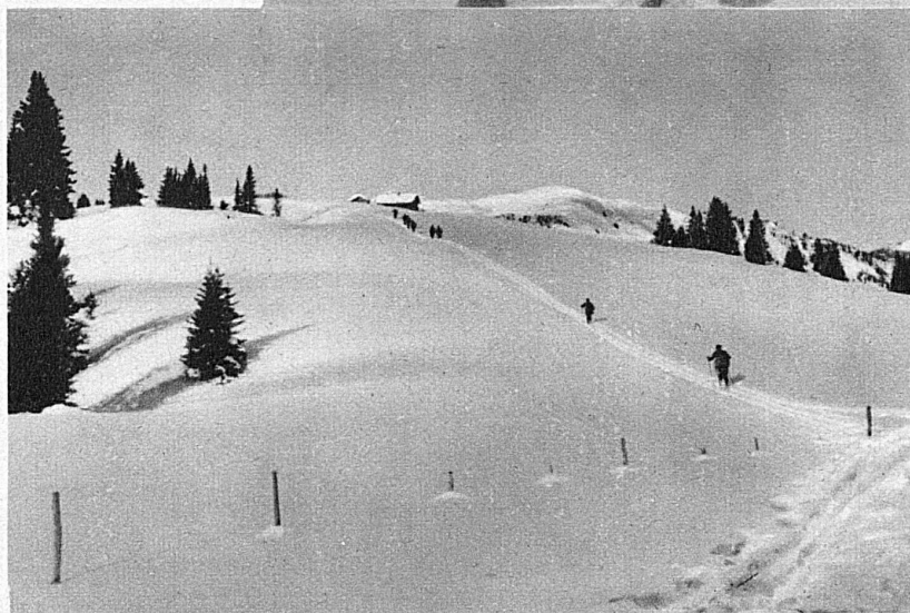
Le Sépey is on the Rail- way between Aigle and Les Diablerets, and of- fers glorious hours of sport to all ski-ers