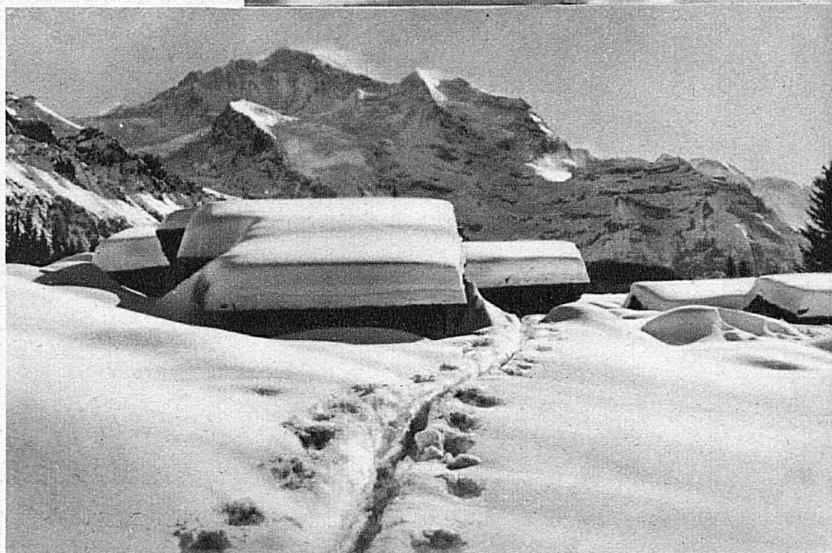
Hahnenmoos near Adelboden

To-day all these various sports, each of which is carried to a fine art, find their permanent