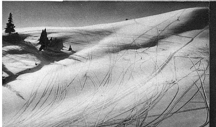
Left: The Hugeligrat near Gstaad has a par- ticularly good repu- tation in Ski-ing circles