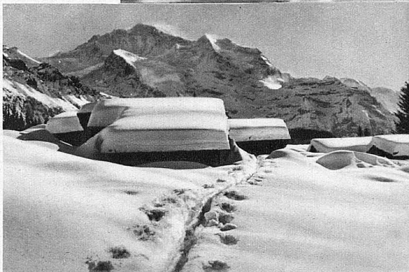
Hahnenmoos near Adelboden

home in sunny, snowy Switzerland, where the air is always bracing and exhilarating, and where the bountiful sun tans in winter as in summer days.