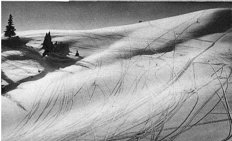
Left: The Hugeligrat near Gstaad has a par- ticularly good repu- tation in Ski-ing circles