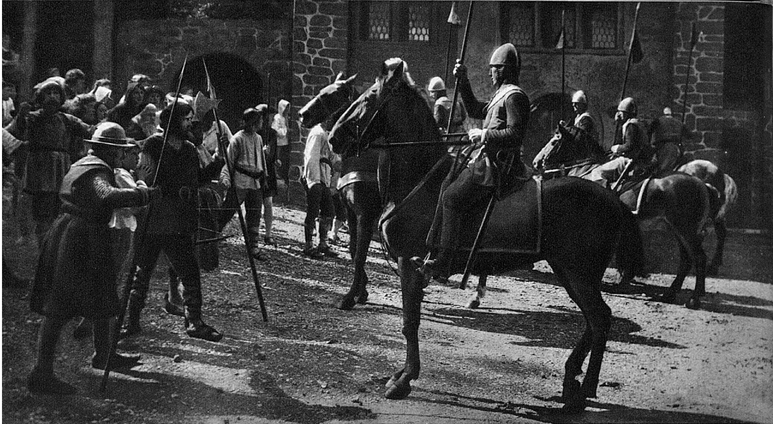
The steel clad knights of Gessler prevent the unarmed peasantry from rescuing Tell from the Governor, to save him from shooting at the apple