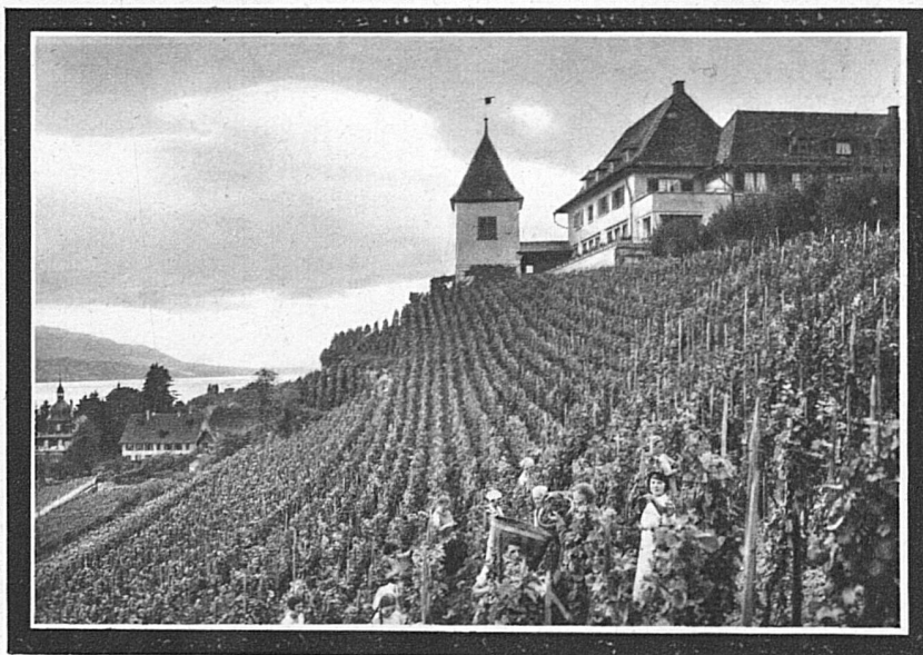
Vintage at Turmgut, near Erlenbach, on the Lake of Zurich

Nor are all the grapes pressed into wine. What food is more nutritious than the juicy, white grape of Switzerland? It is besides an antidote to gout and many kindred ills. Try a grape cure! Why not? Wash them well, then eat them skins and pips and all! An autumn visit to Switzerland may well save you a doctor's bill.— A. B. Winter.