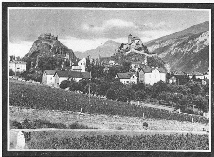
Sion, in the Valais