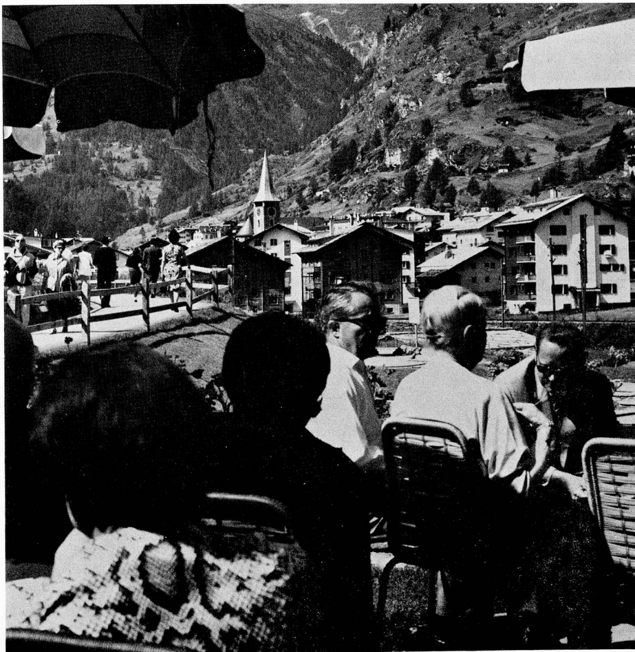
Zermatt is beautiful as this picture shows. All praise to those who are fighting to keep it that way.

It has been reported that, on at least one occasion, there were more than 100 climbers on the mountain at the same time.