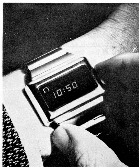
Omega Time Computer

Omega believes it has now established a lead by offering watches of all three electronic types. With a growing consumer awareness of electronics and their advantages over mechanical watches, the company project a rapidly growing demand by the end of this year and estimate that in 1975 one in every four Omega men's models sold will be with electronic movements.